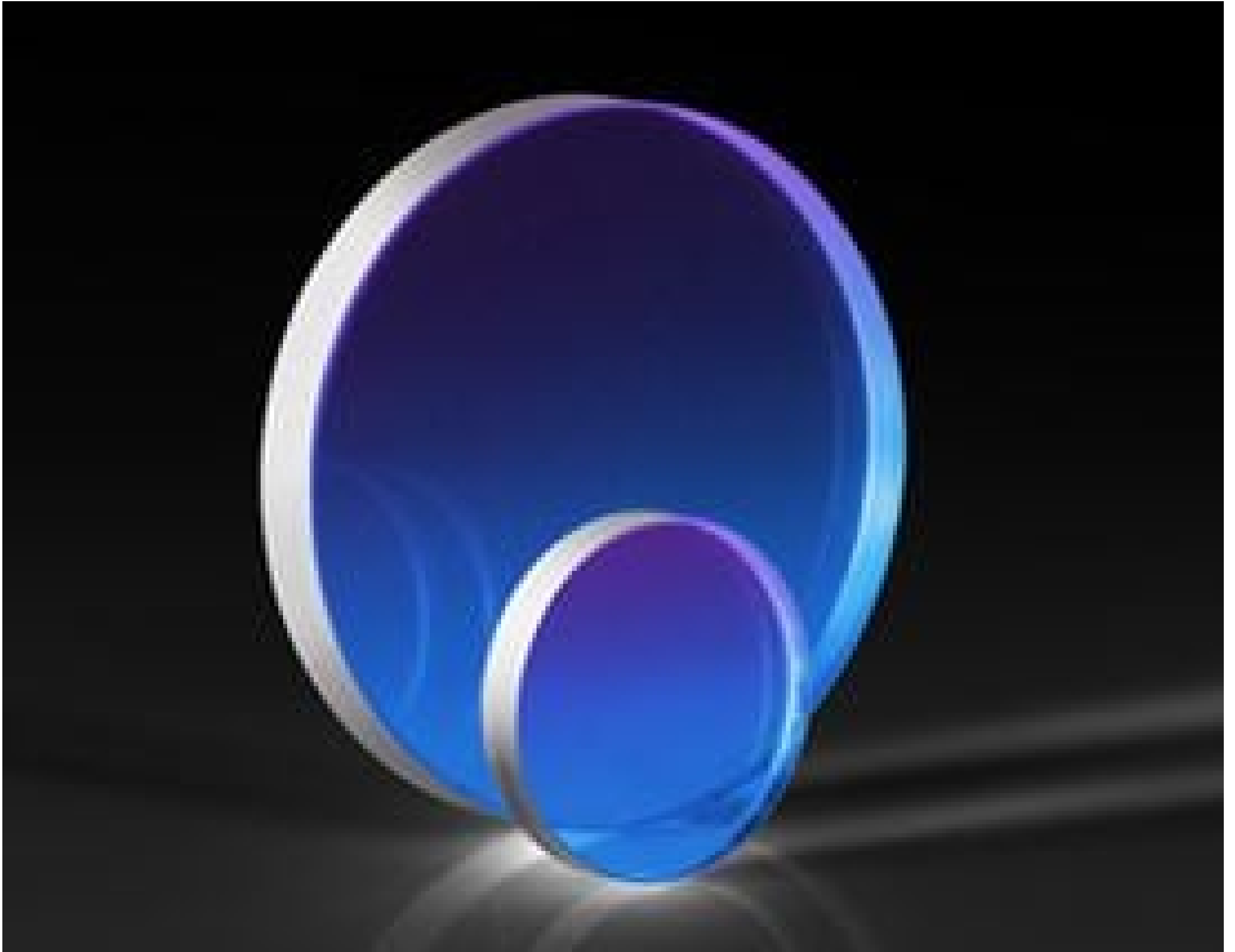
Magnesium Fluoride (MgF 2 ) Windows