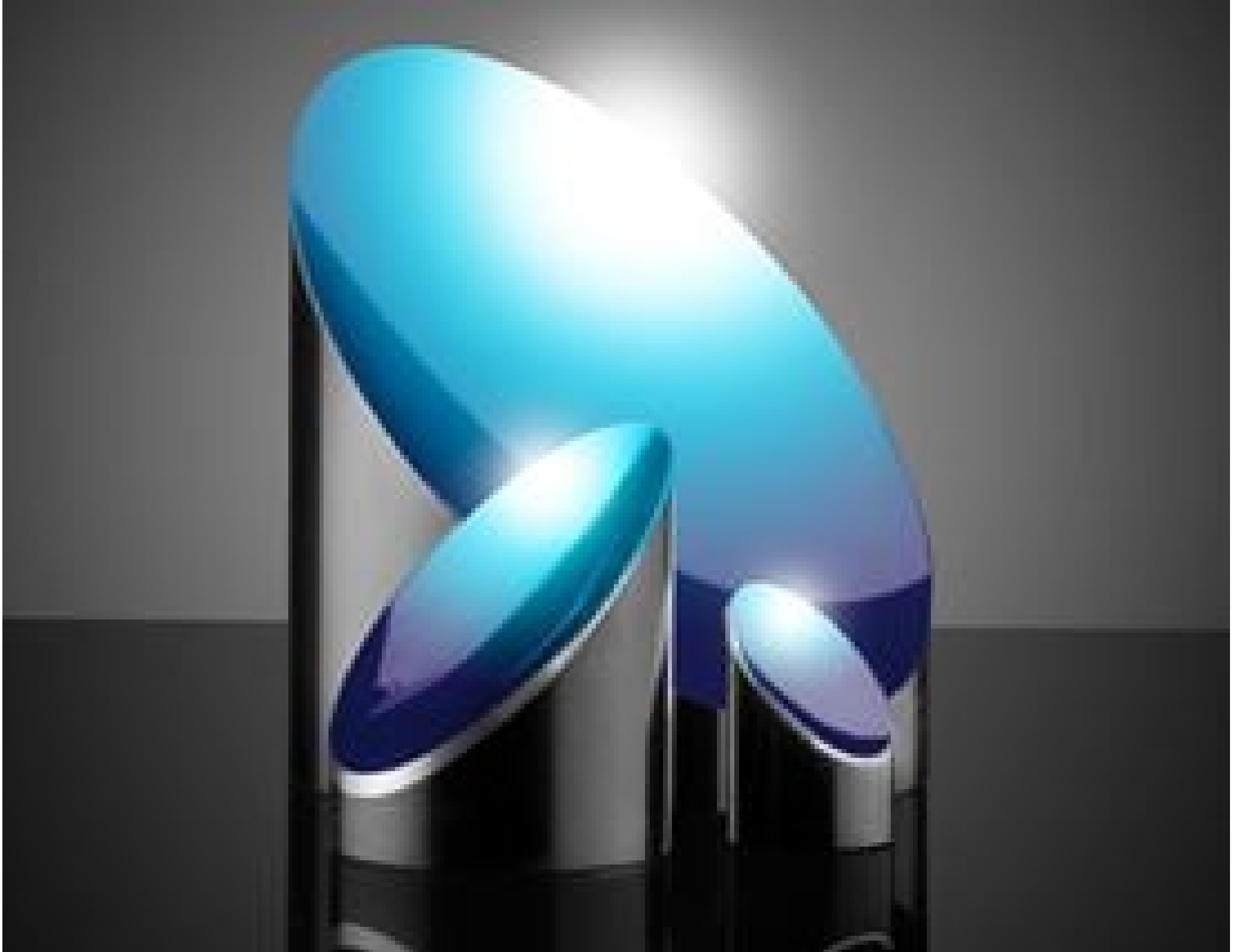
TECHSPEC® Ultrafast-Enhanced Silver Coated Off-Axis Parabolic (OAP) Mirrors