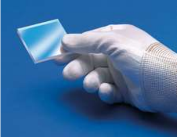
Component Handling Tools

These optics require special handling to avoid damage and ensure long-term performance. Proper handling, cleaning, and storage are essential to maintain optical quality. Explore our Optics Cleaning Resources for step-by-step guides and best practices. For personalized assistance, Email us or Chat with our technical support team.