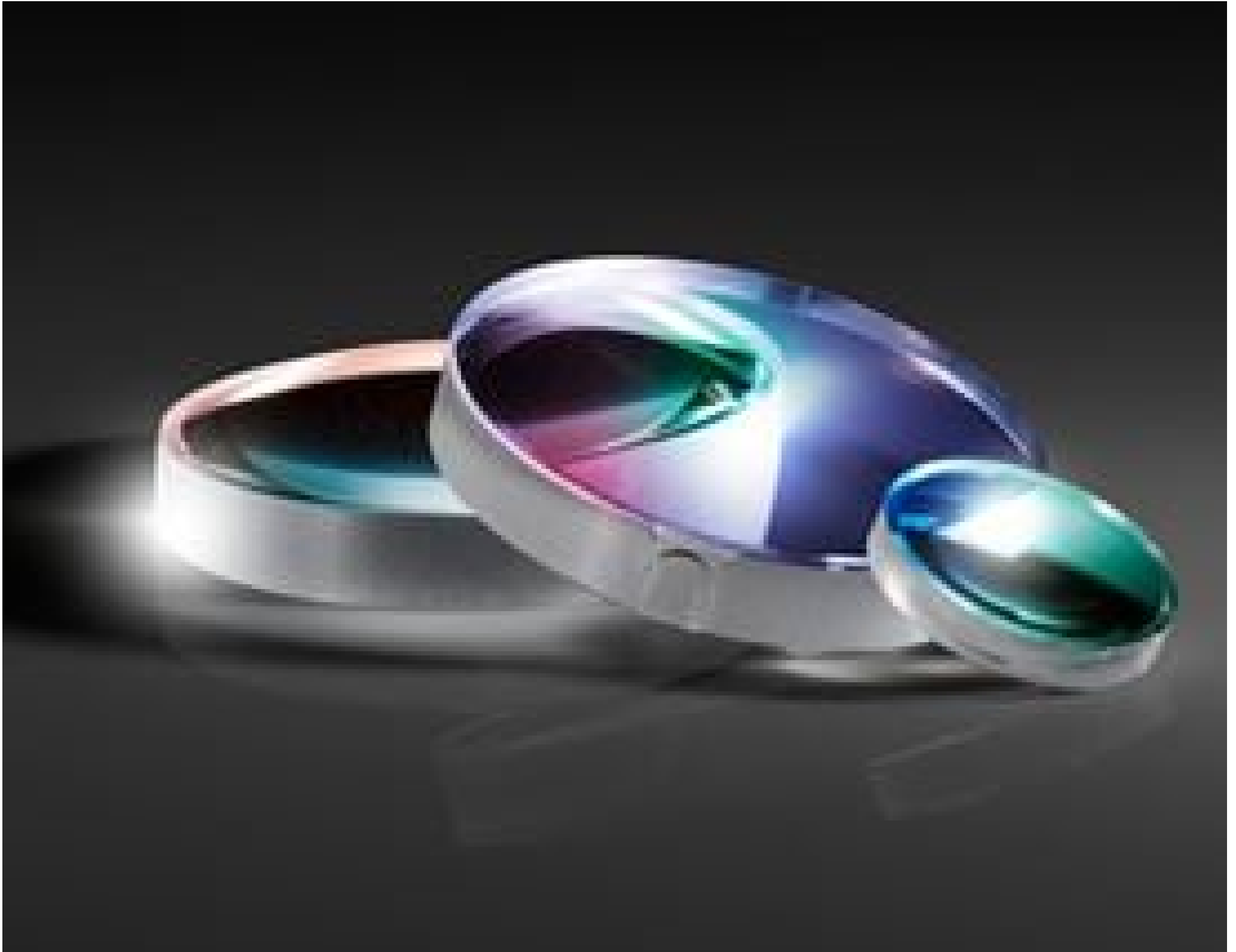
Molded Acrylic Aspheric Lenses