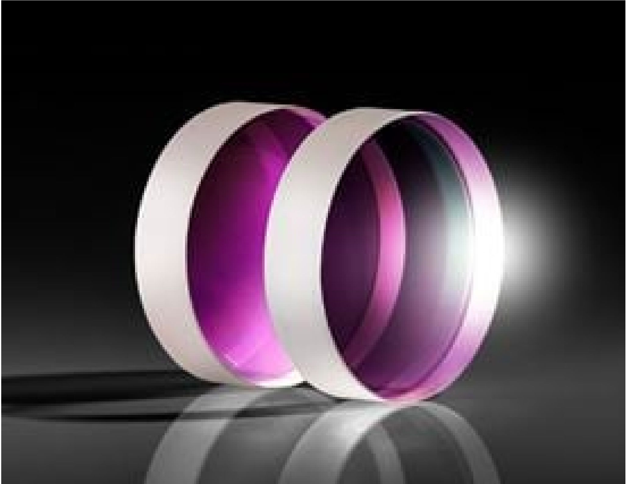
UltraFast Innovations (UFI) Ultra-Broadband Complementary Chirped Mirror Pairs