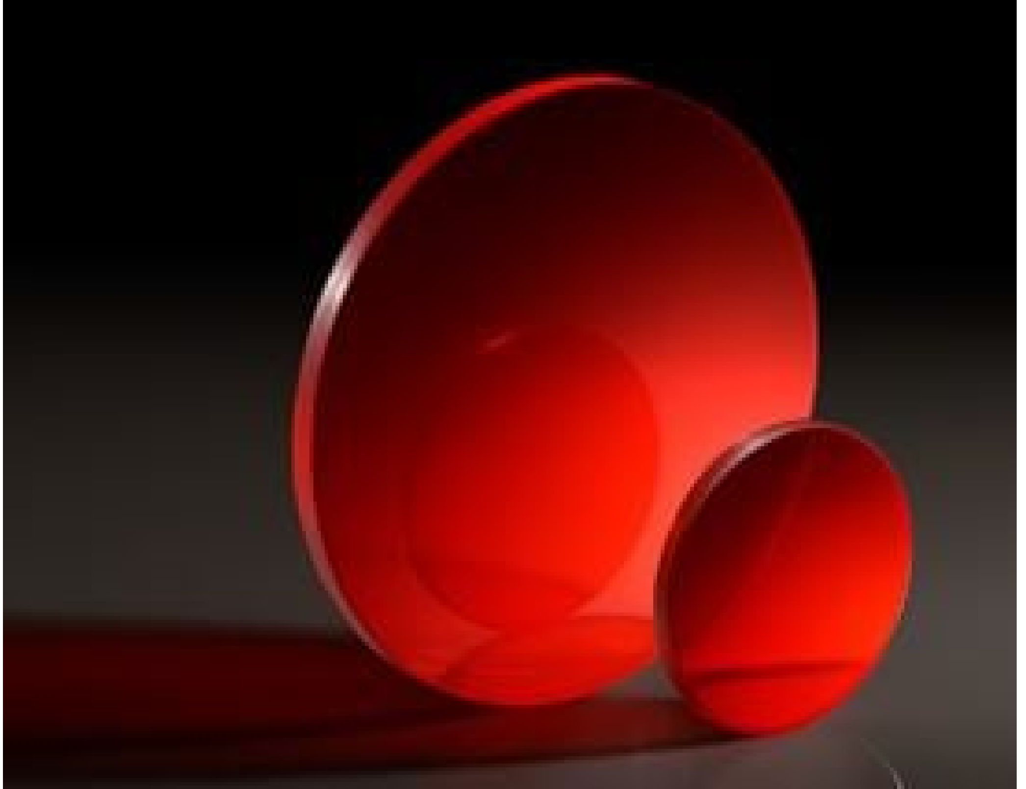
Thallium Bromiodide (KRS-5) Windows