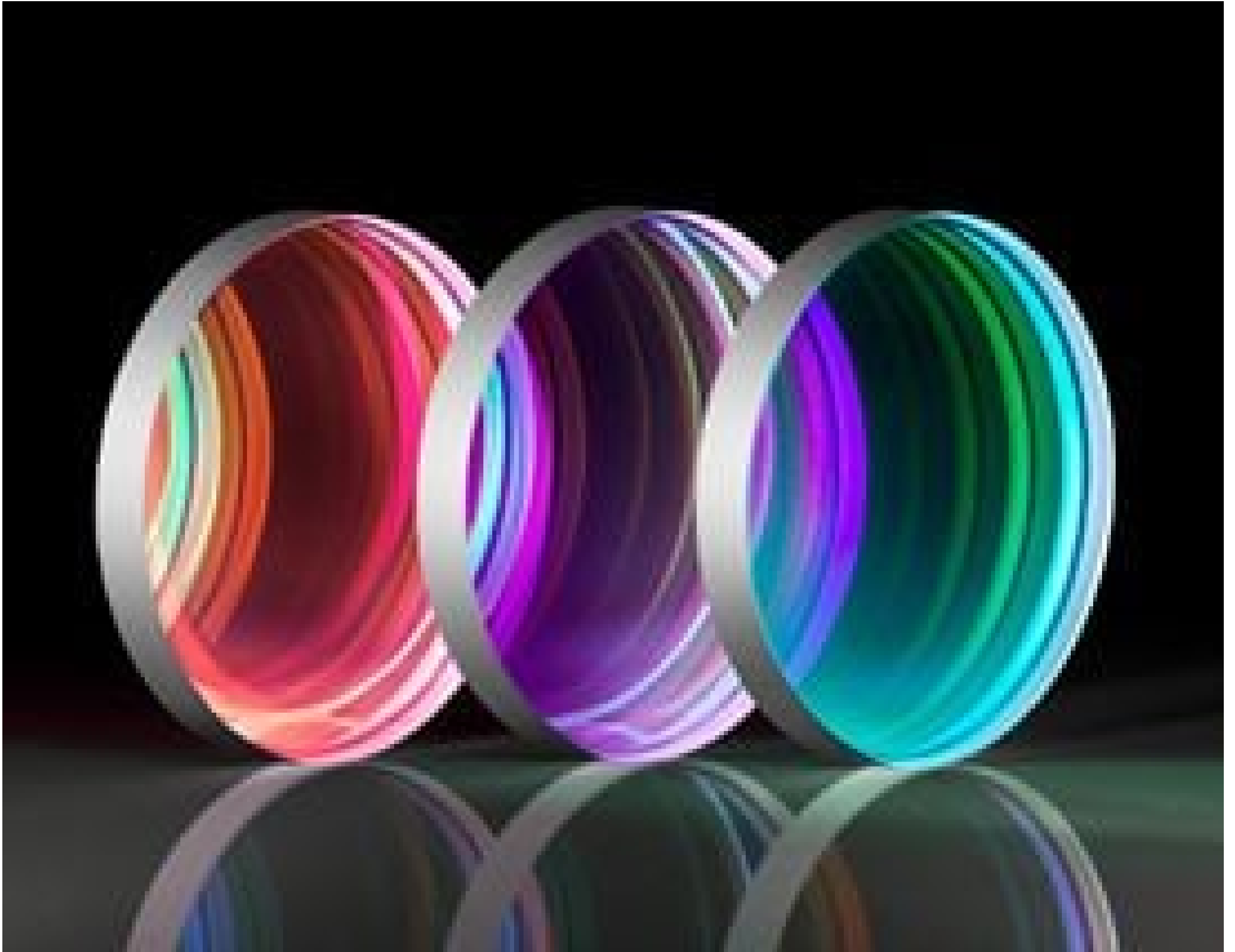
Ultrafast Harmonic Separators