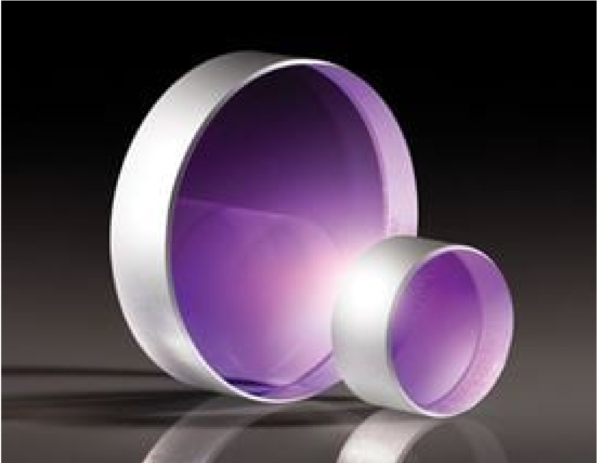
TECHSPEC \lambda/10 Laser Line Coated Windows