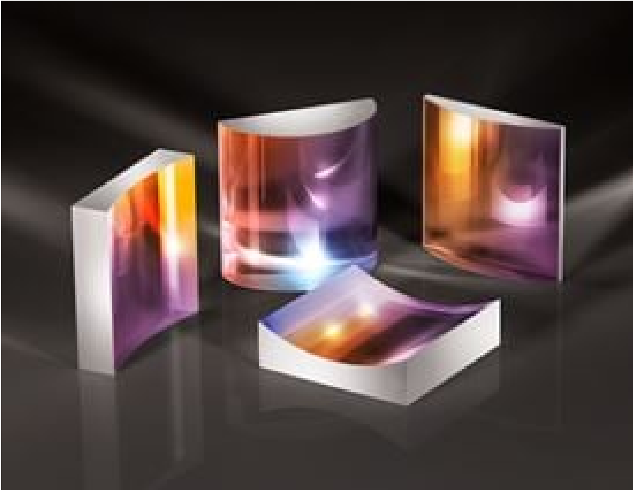
TECHSPEC Beam Shaping Fused Silica Cylinder Lenses