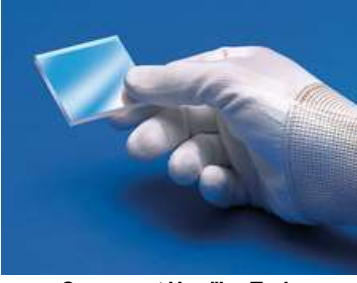
Component Handling Tools

These optics require special handling to avoid damage and ensure long-term performance. Proper handling, cleaning, and storage are essential to maintain optical quality. Explore our Optics Cleaning Resources for step-by-step guides and best practices. For personalized assistance, Email us or Chat with our technical support team.