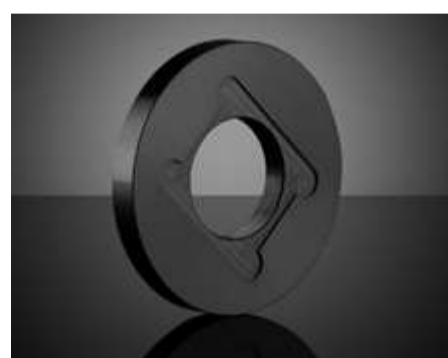
#12-837 - 25.0mm Square Polarizer Adapter, 50.0mm Outer Diameter £31.20