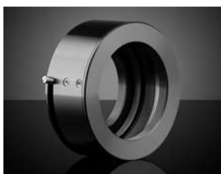
#11-147 - 50mm Diameter, T-Mount Polarizer Holder £181.60