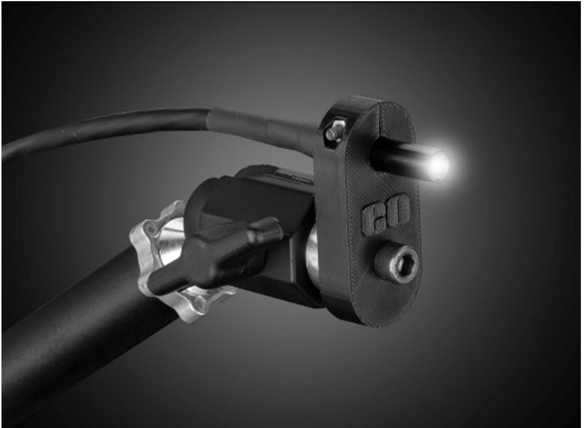
Spot Light Configuration