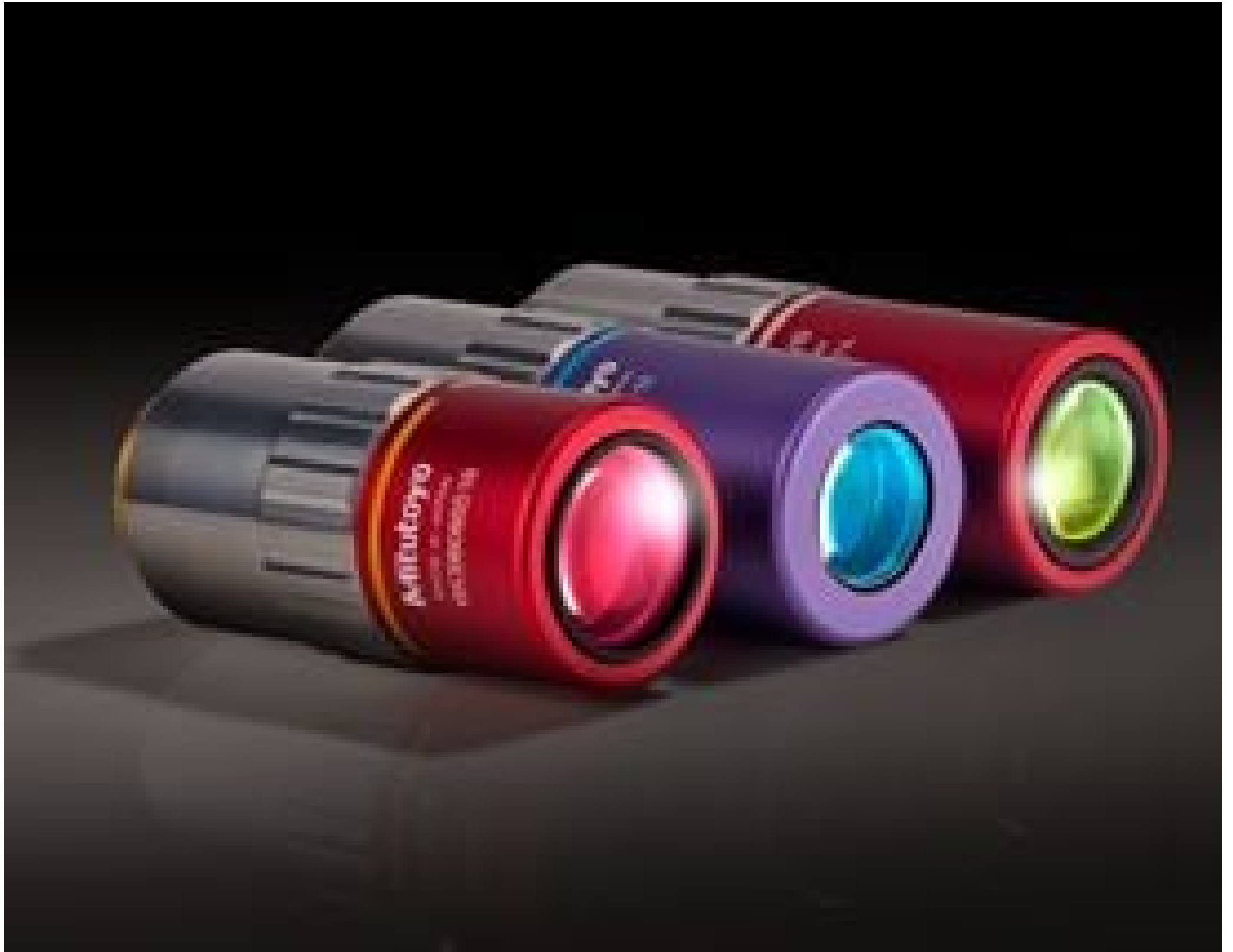
Mitutoyo NIR, NUV, and UV Infinity Corrected Objectives