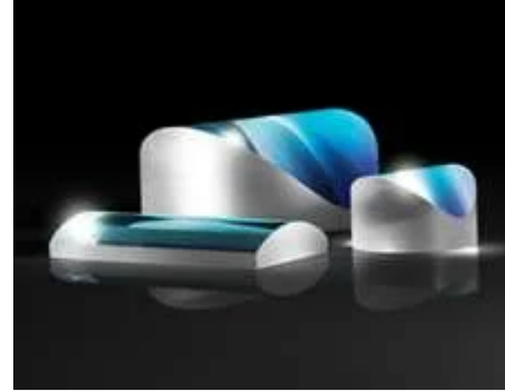
#25-489 - 20mm H x 20mm L x 25mm FL Uncoated, Illumination Grade PCX Cylinder Lens £86.00