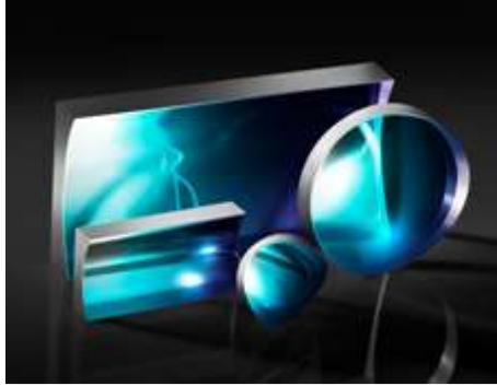
#69-843 - 25mm Dia x -50mm FL VIS-NIR Coated, Illumination Grade PCV Cylinder Lens £83.00