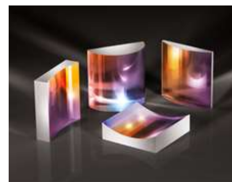
Laser Grade Broadband Cylinder Lenses