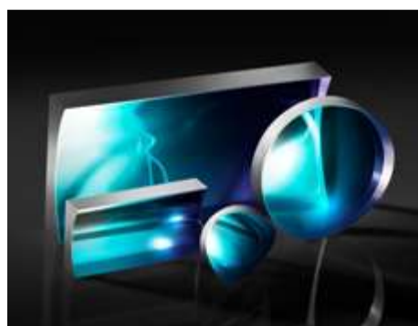
Illumination Grade PCV Cylinder Lenses