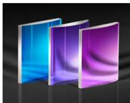
Laser Grade Laser Line Cylinder Lenses