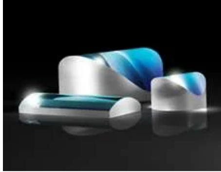
#68-033 - 12.5mm H x 25mm L x 50mm FL Uncoated, Illumination Grade PCX Cylinder Lens £57.00