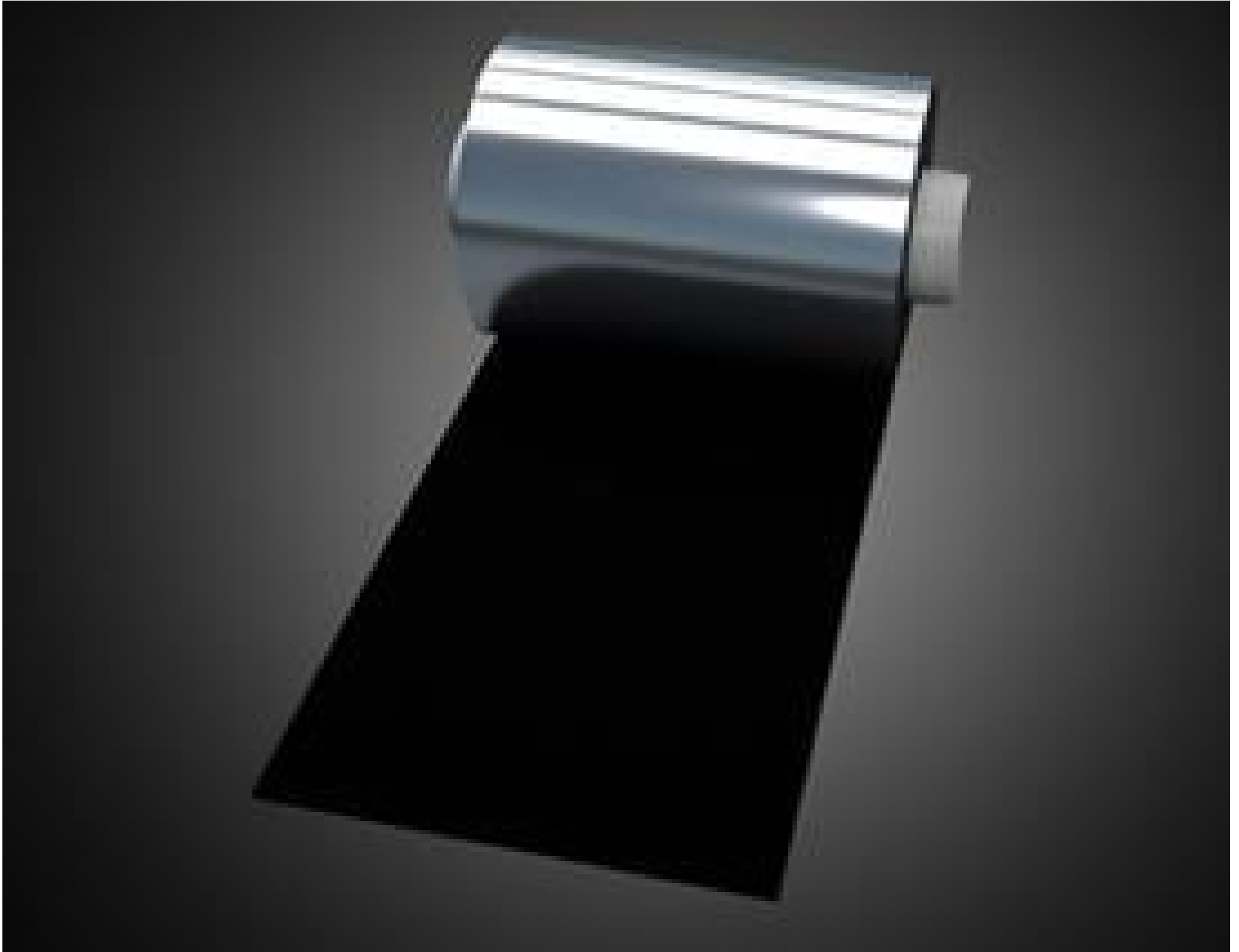
Roll of Spectral Black/Metal Velvet