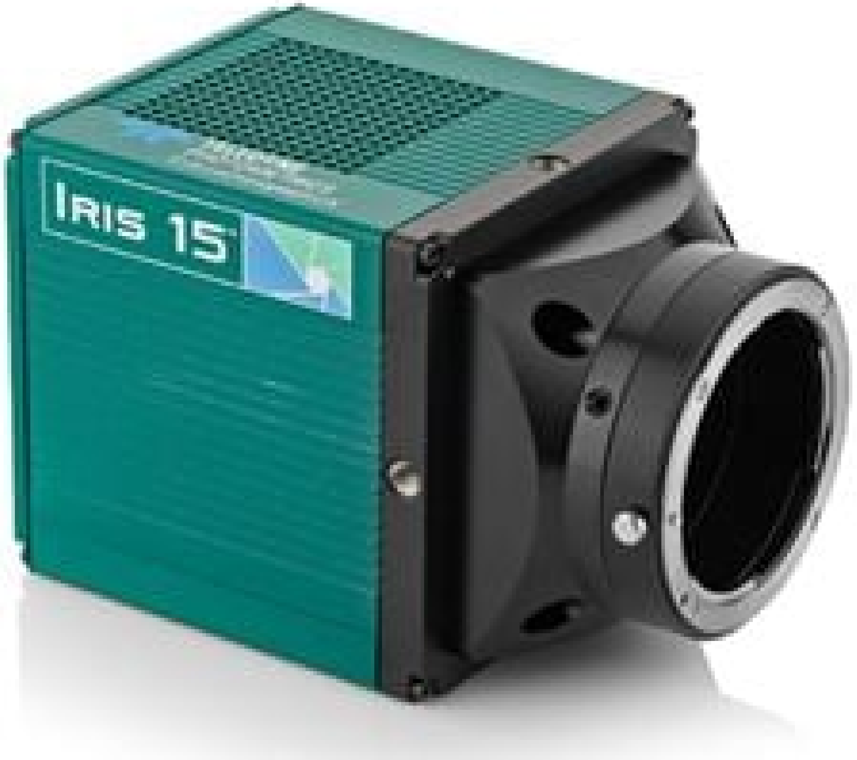
#90-391 Photometrics Iris 15 PCIe Camera