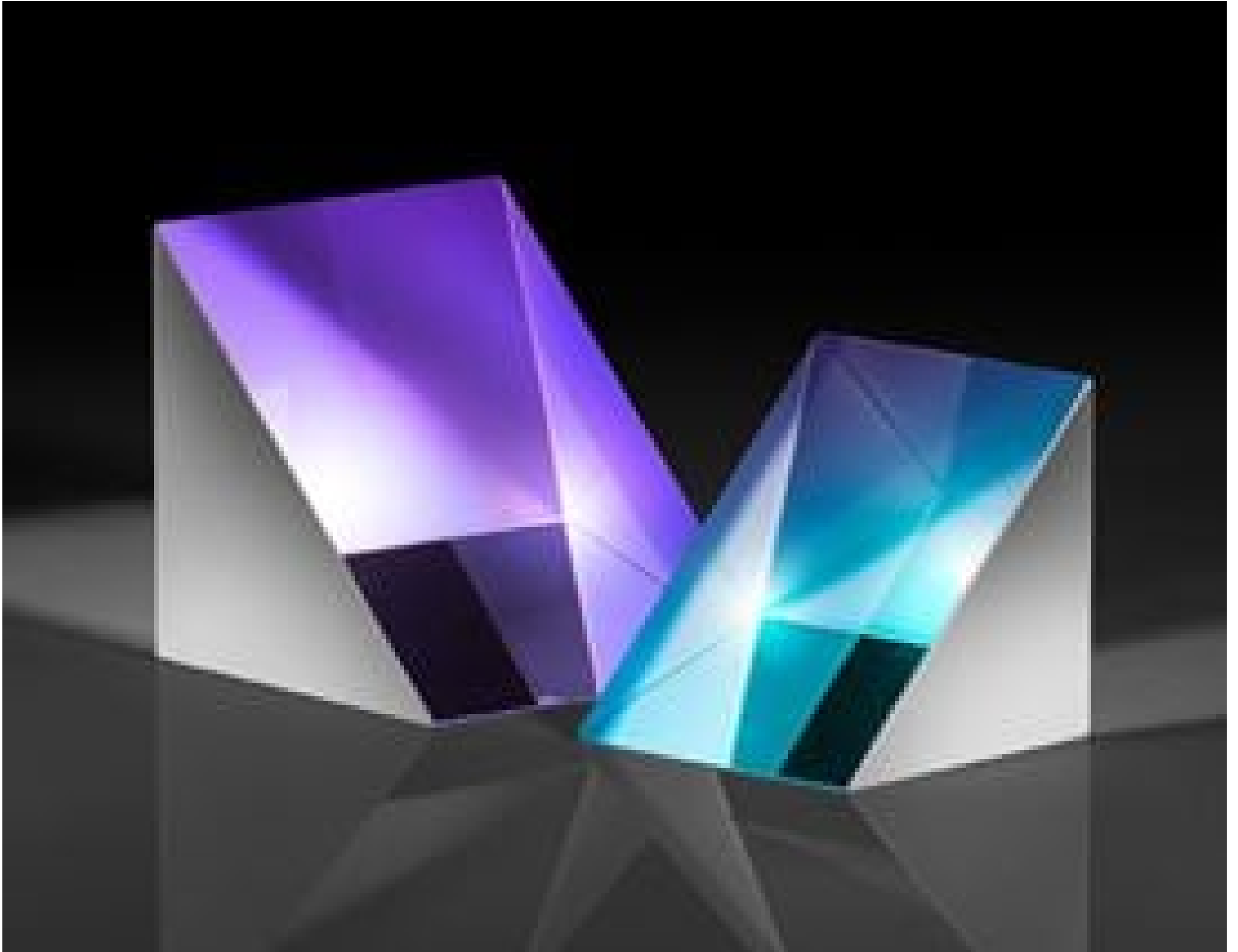
N-BK7 Right Angle Prisms