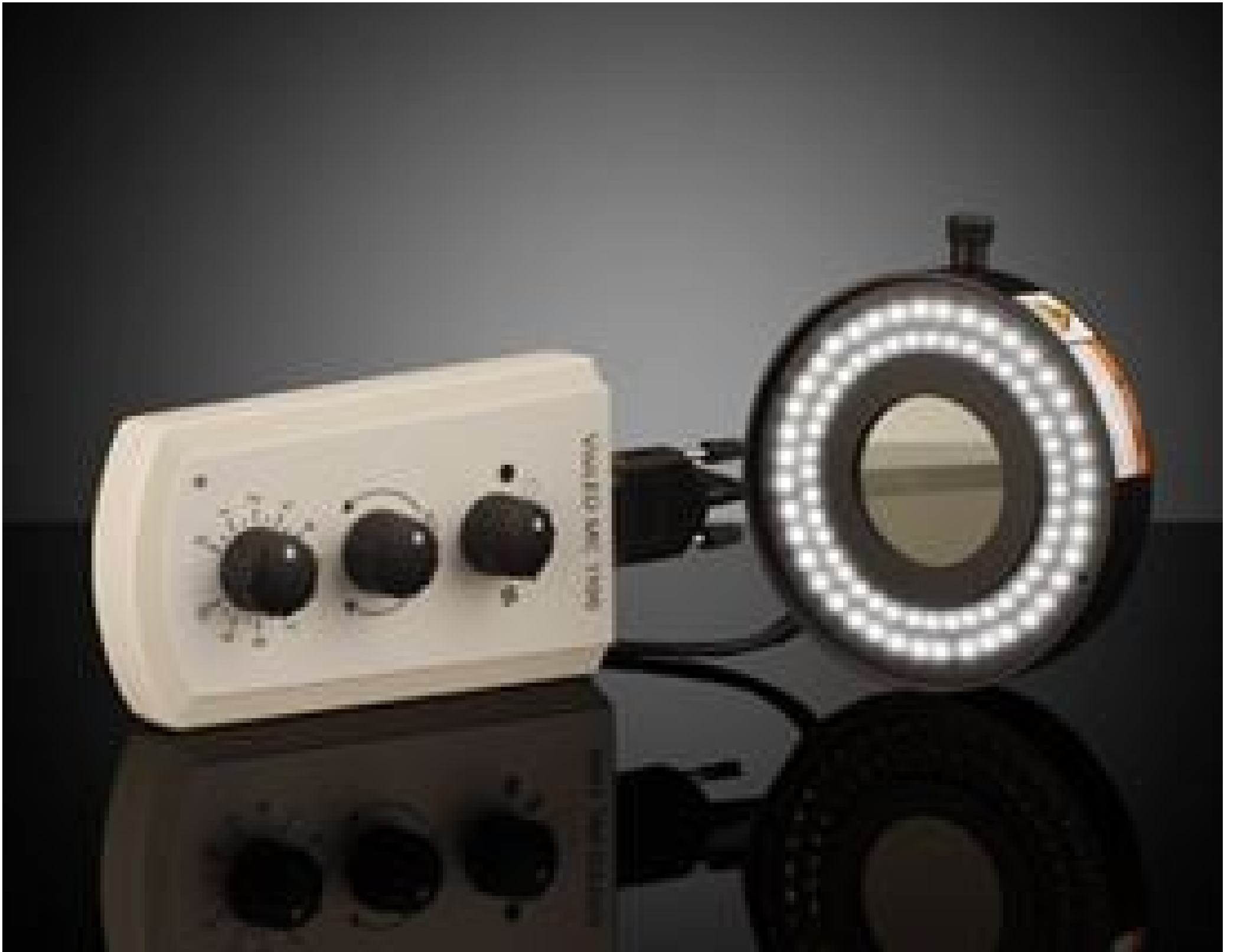
Ring light, controller & power supply required and sold separately.