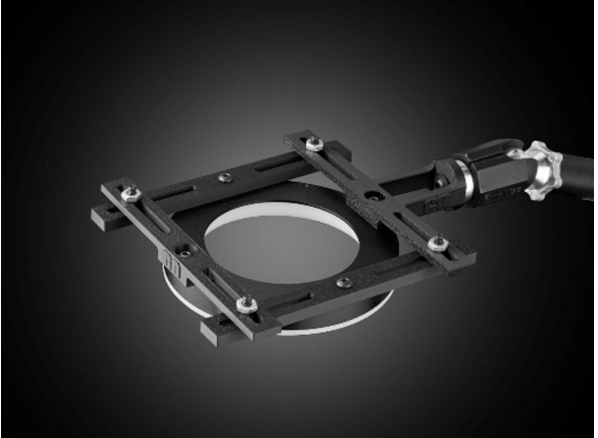
Ring Light Configuration