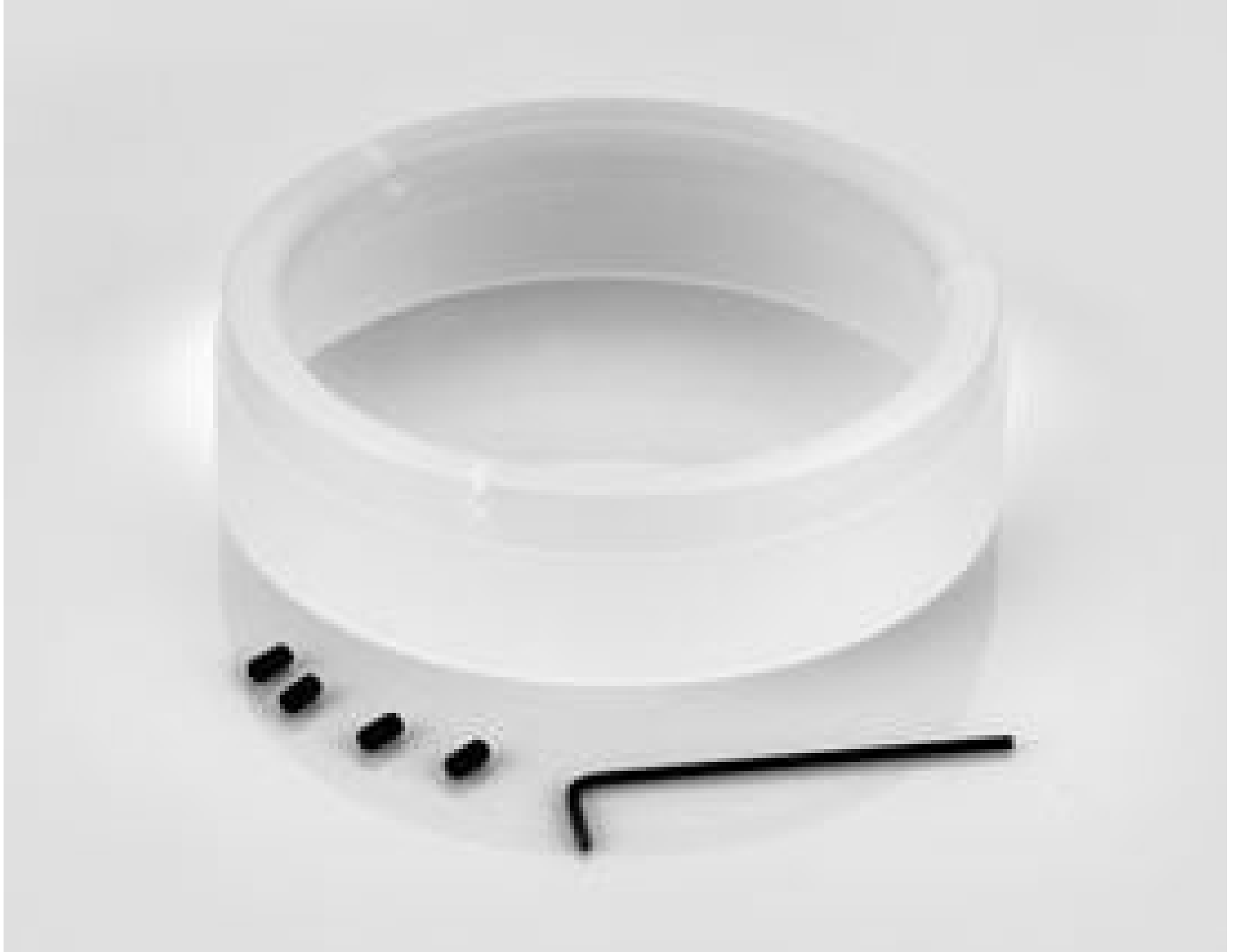
Ring Diffusion Plate