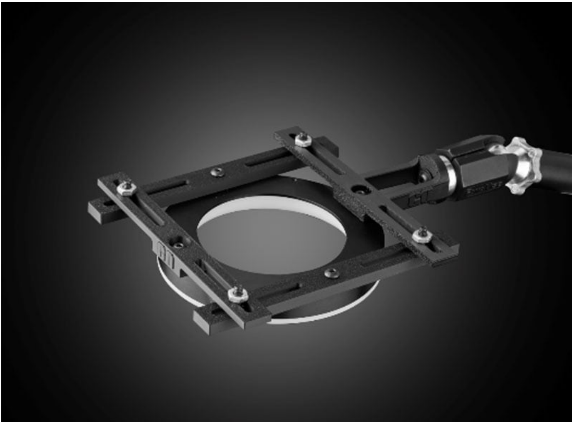
Ring Light Configuration