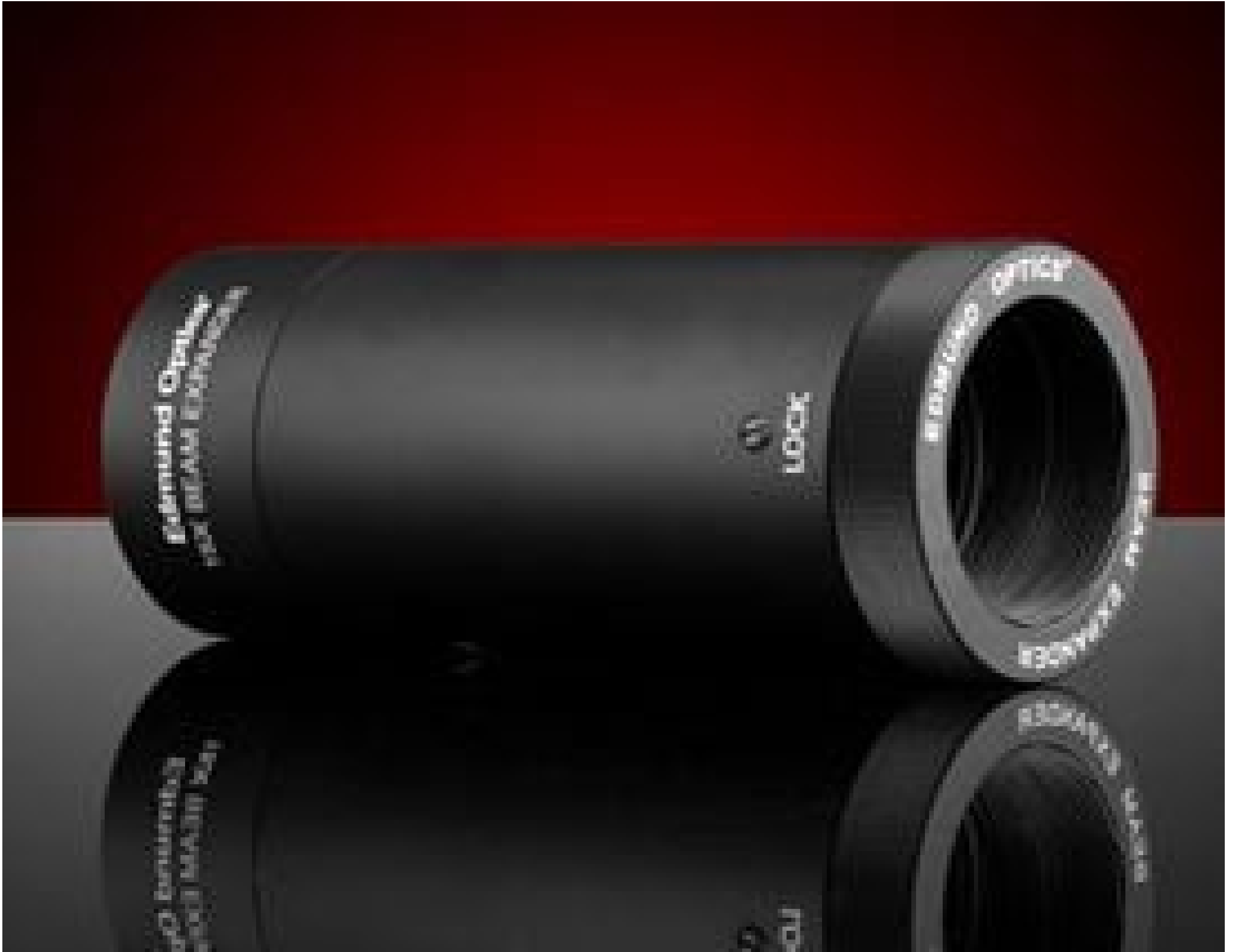
15X HeNe Fixed Beam Expander, #58-209