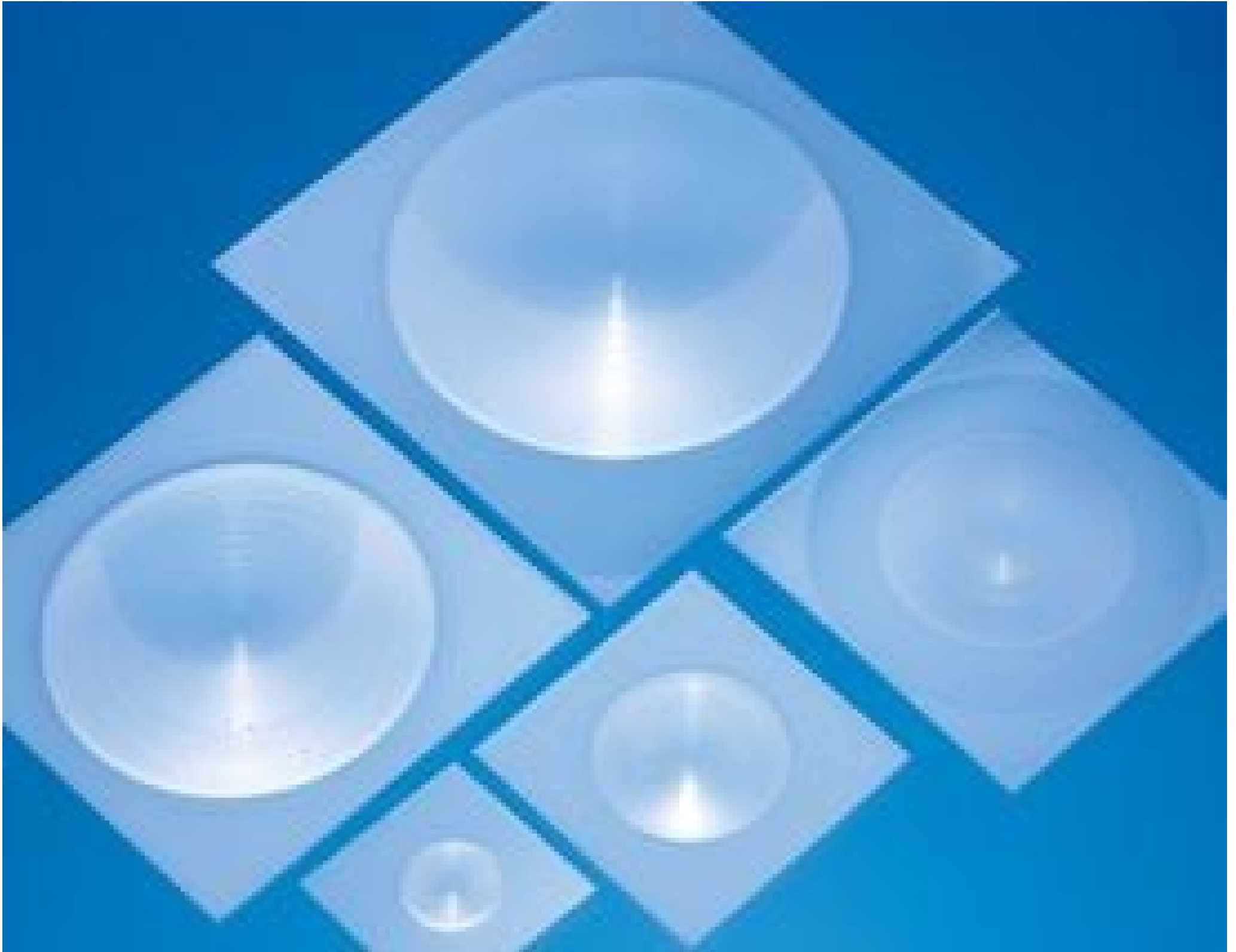
Infrared (IR) Fresnel Lenses