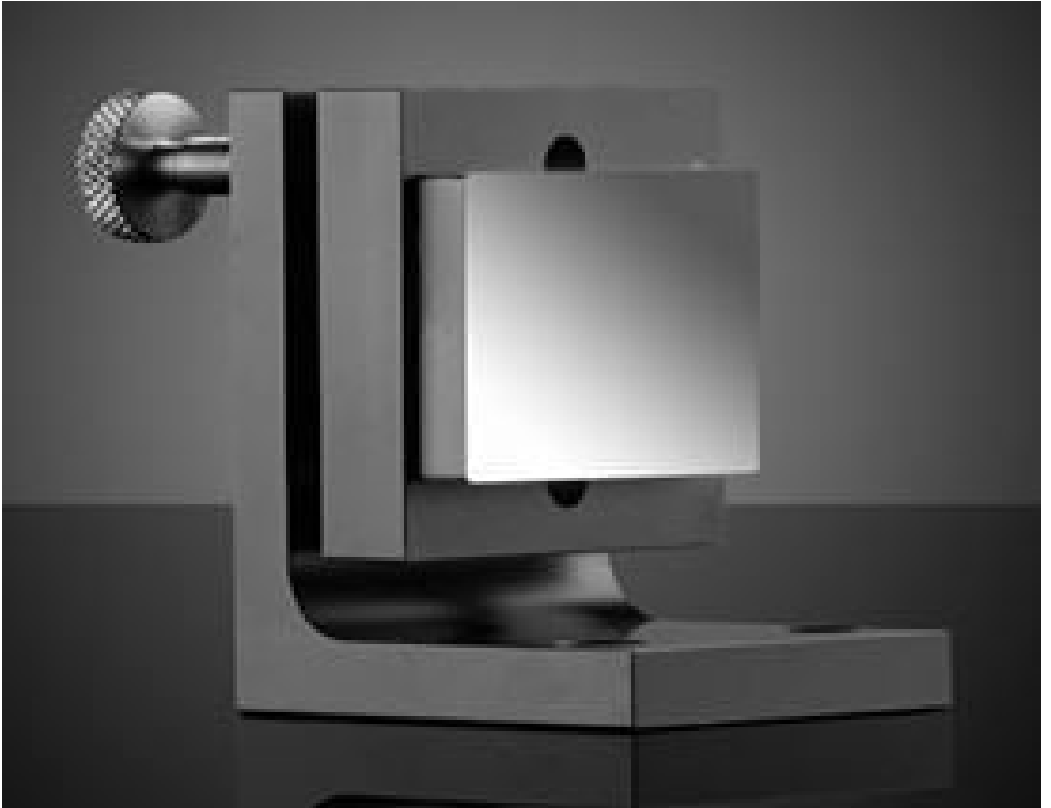
Angle Mount with Mirror