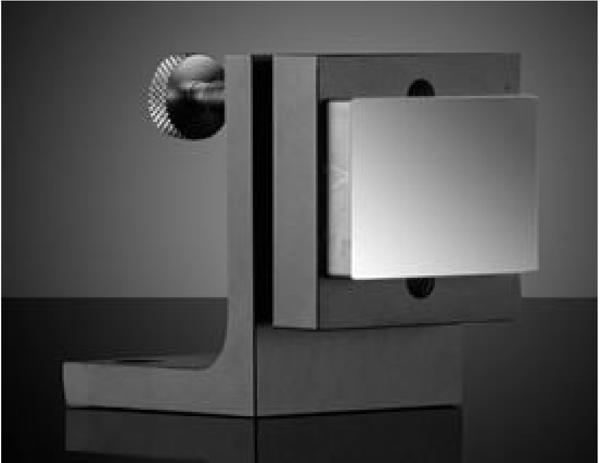
1.5" Reverse Angle Mirror Mount with Mirror