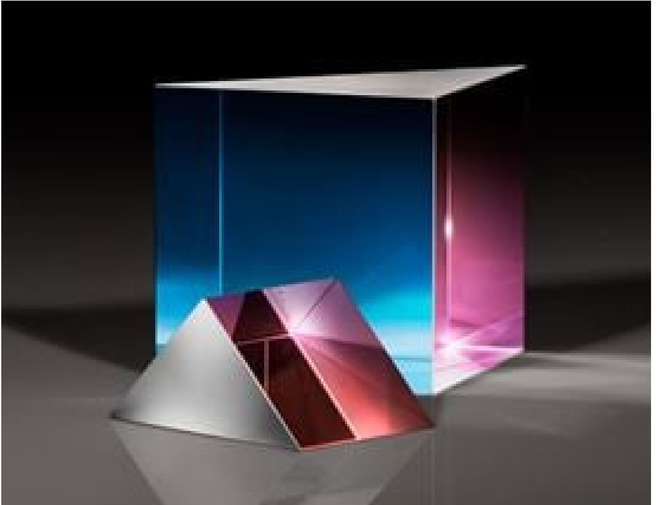
TECHSPEC High Tolerance UV Fused Silica Right Angle Prisms