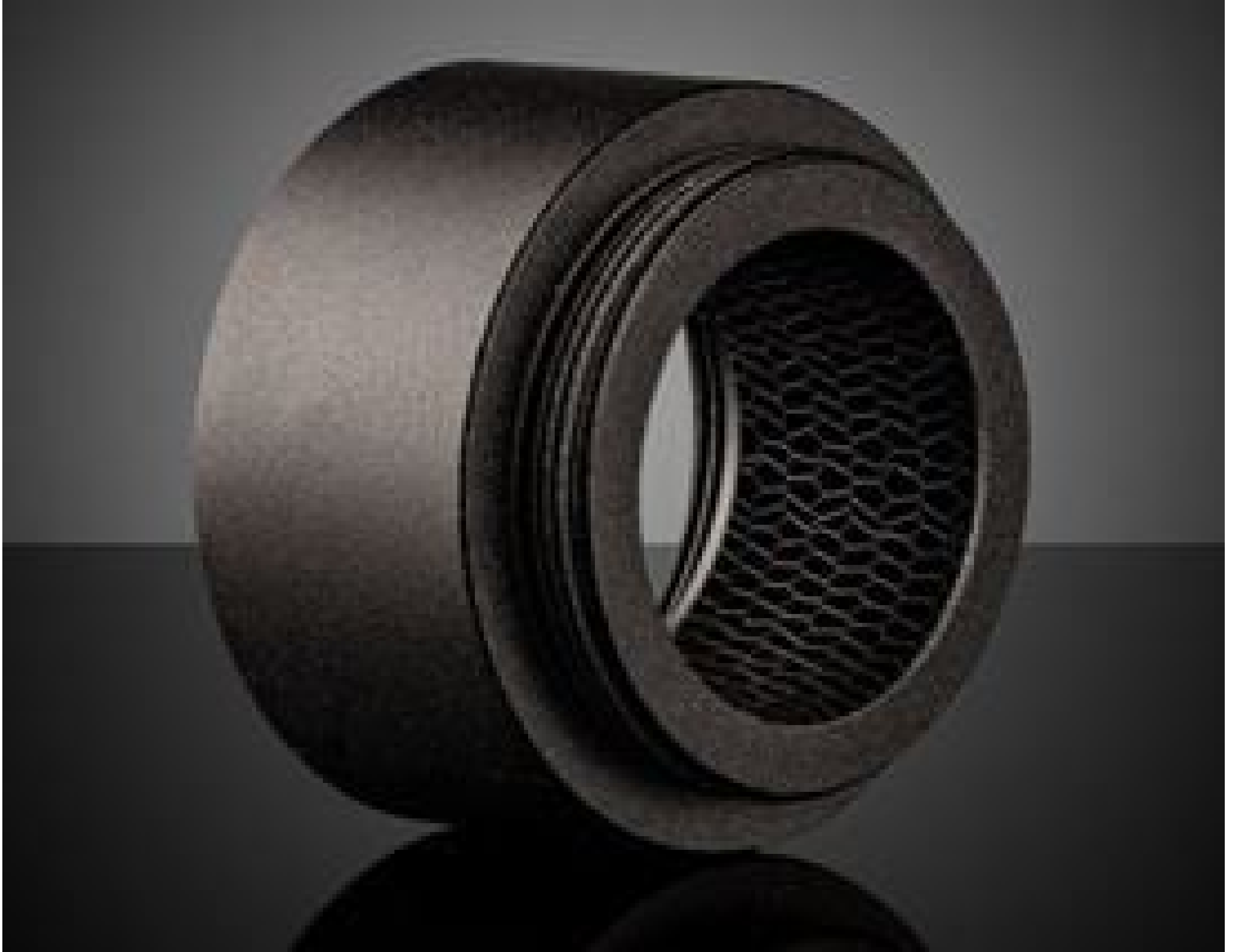
15mm Length, Acktar Hexa-Black™ C-Mount Noise Reduction Extension Tube