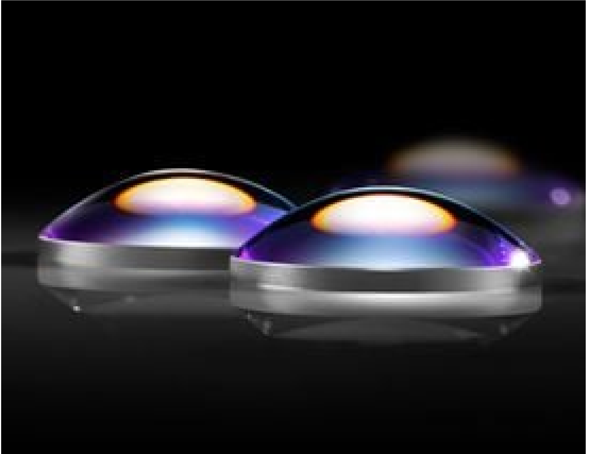
TECHSPEC® Precision Molded Aspheric Lenses