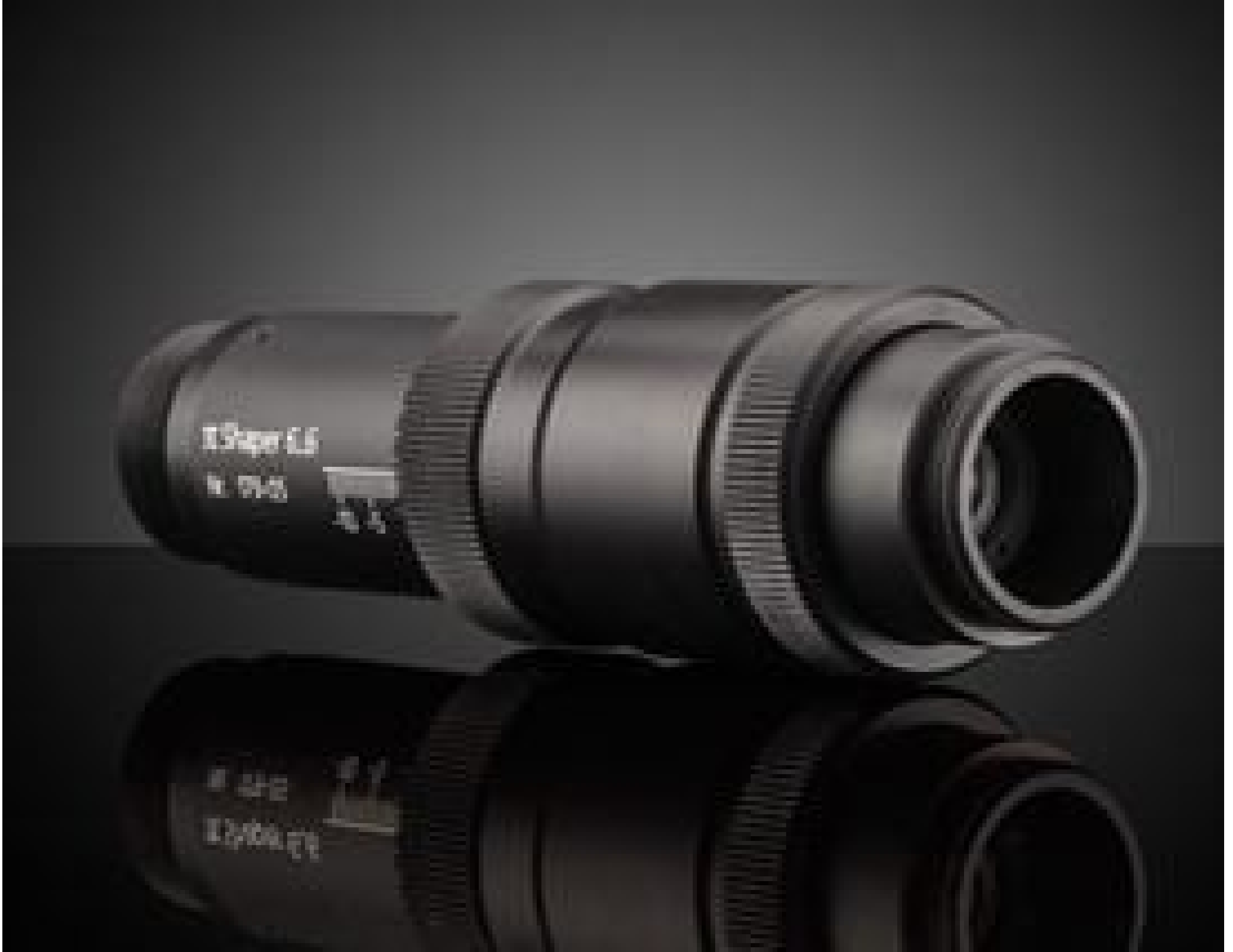
Flat Top Beam Shaper