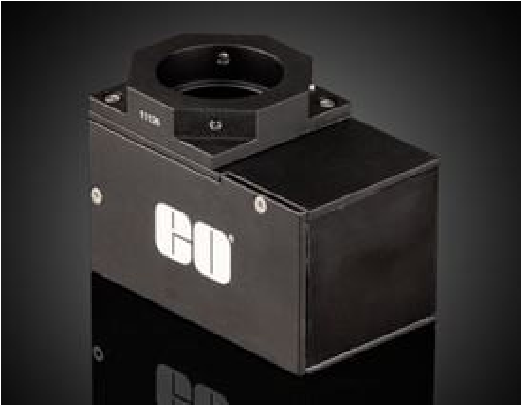
Optical Axis Offset Prism Adapter