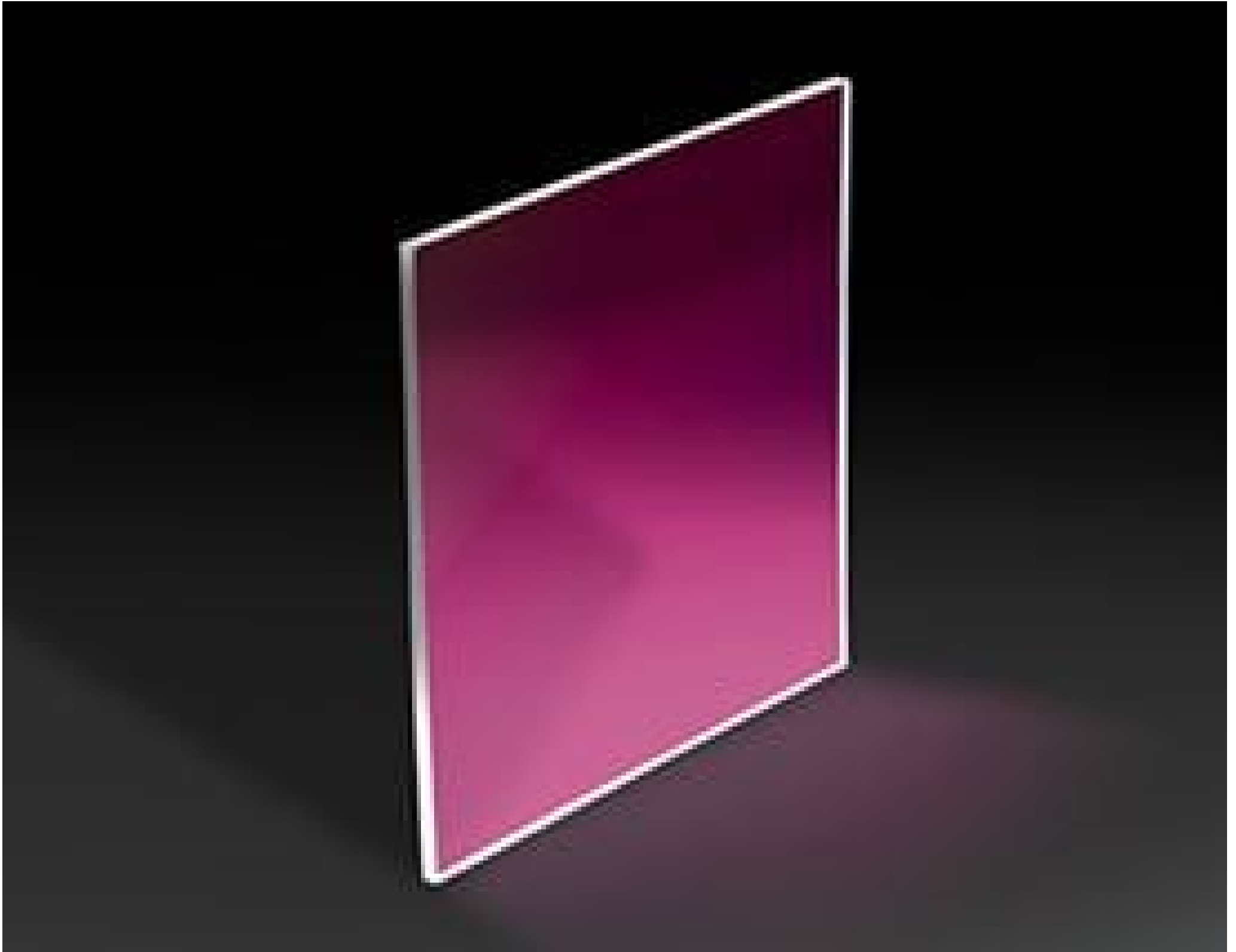
Gorilla® Glass Windows