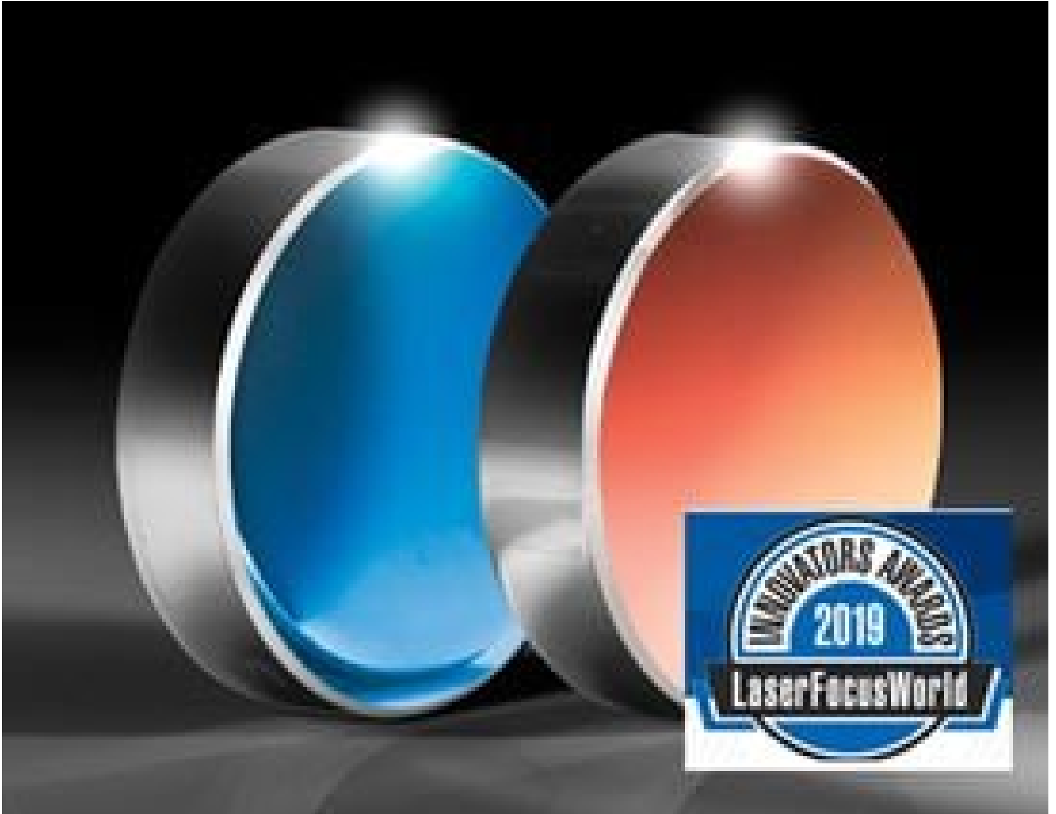
Extreme Ultraviolet (EUV) Flat Mirrors