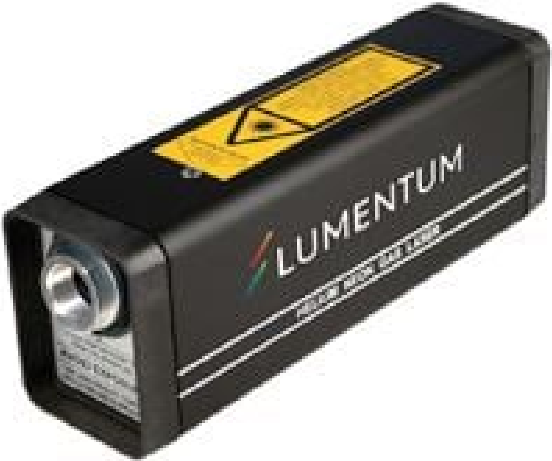
Low-Noise Lumentum Helium-Neon Laser with self-contained power supply