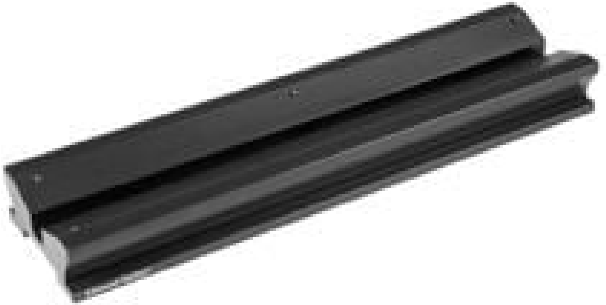
12" Length, Dovetail Optical Rail, #54-401