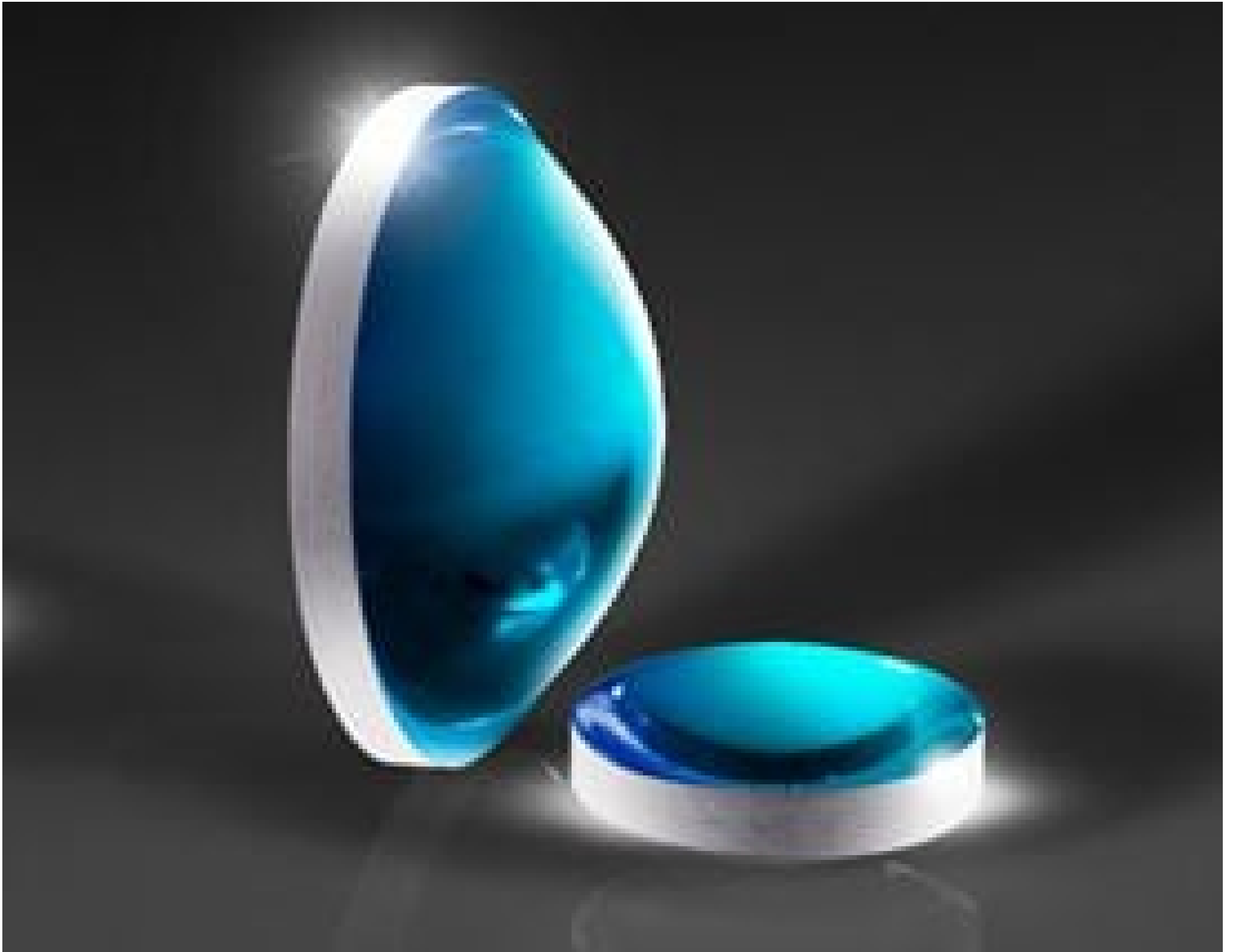
Molded Aspheric Condenser Lenses