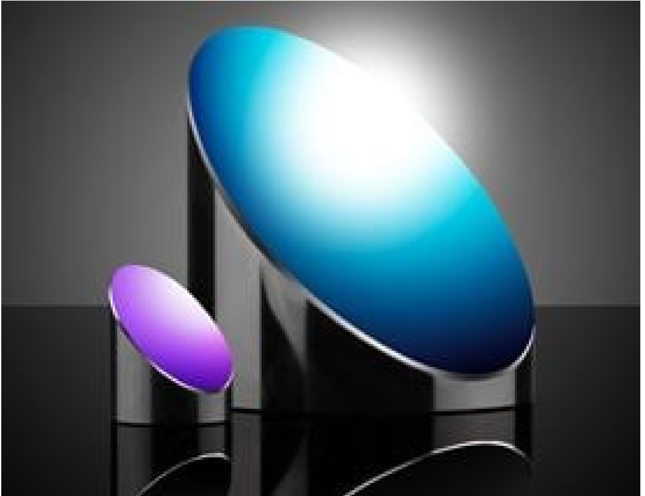
TECHSPEC® Laser Line Coated Off-Axis Parabolic (OAP) Mirrors