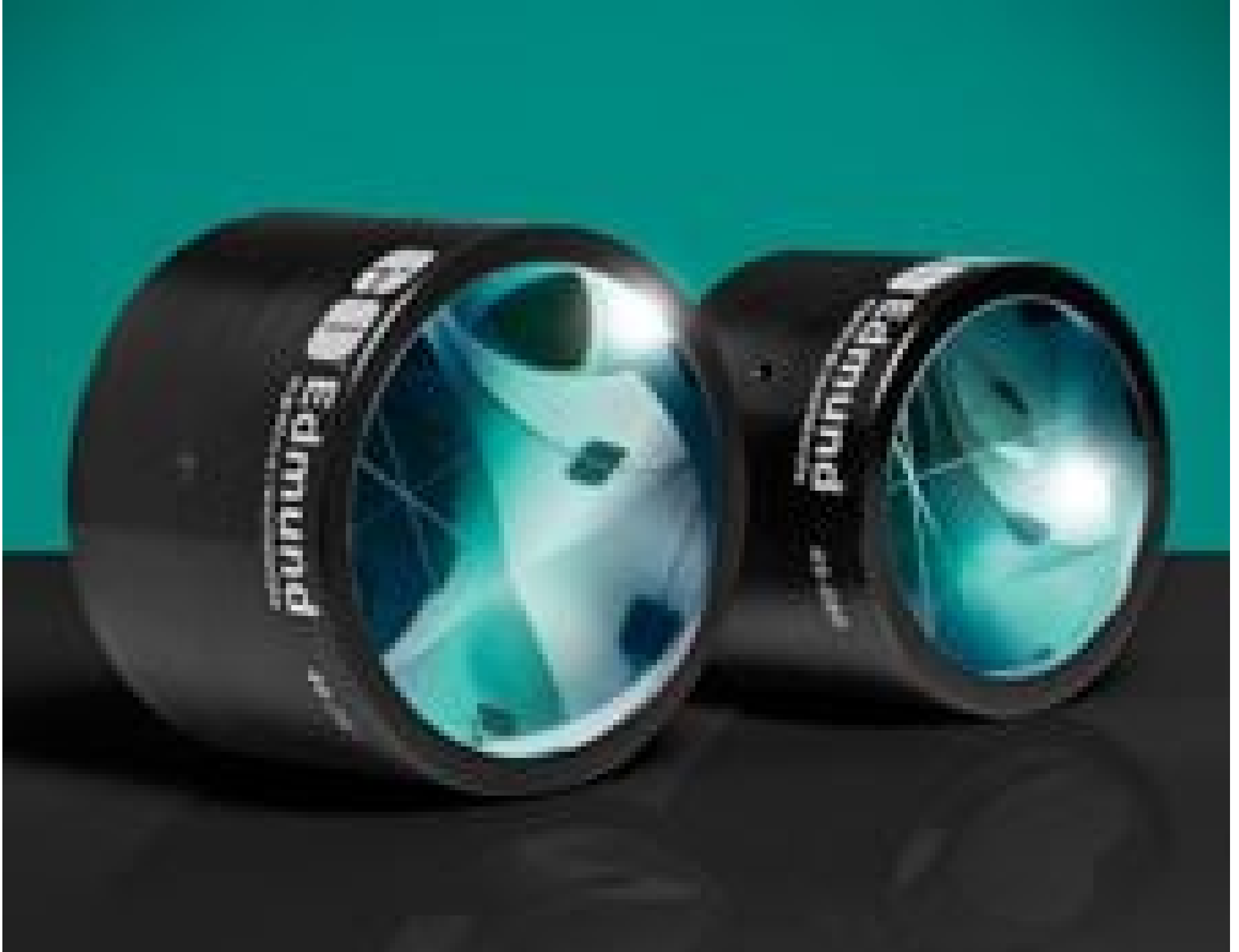
Mounted Fused Silica Corner Cube Retroreflectors