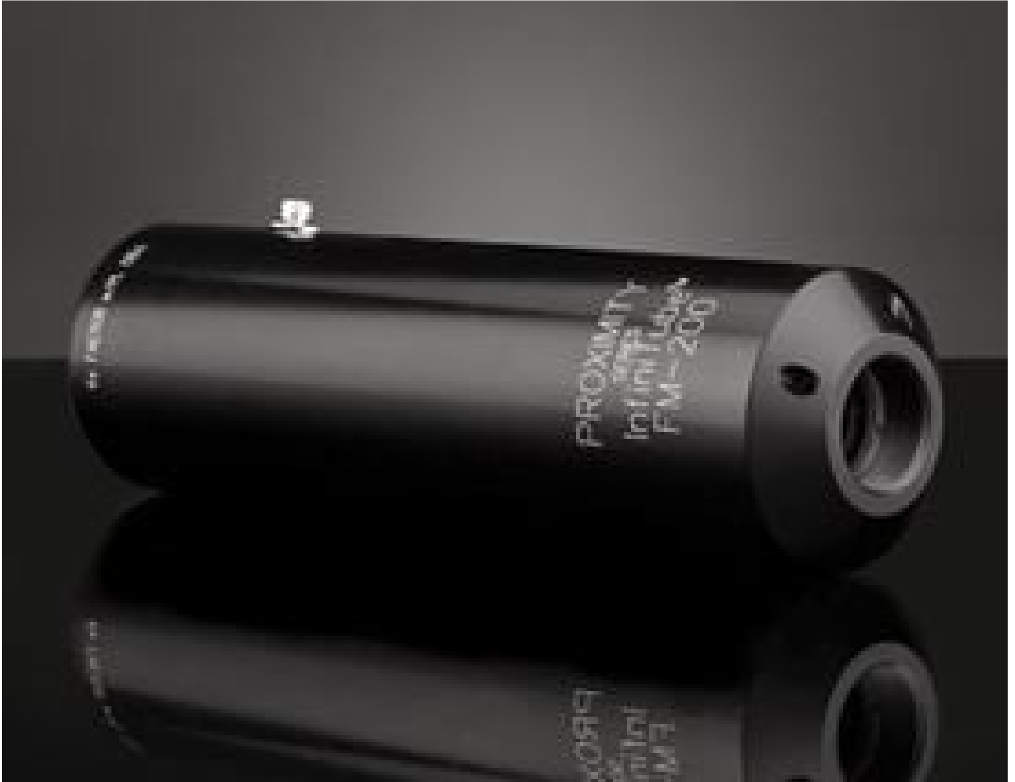
InfiniTube FM-200 (1X), #58-310

See More by Infinity Photo-Optical Company