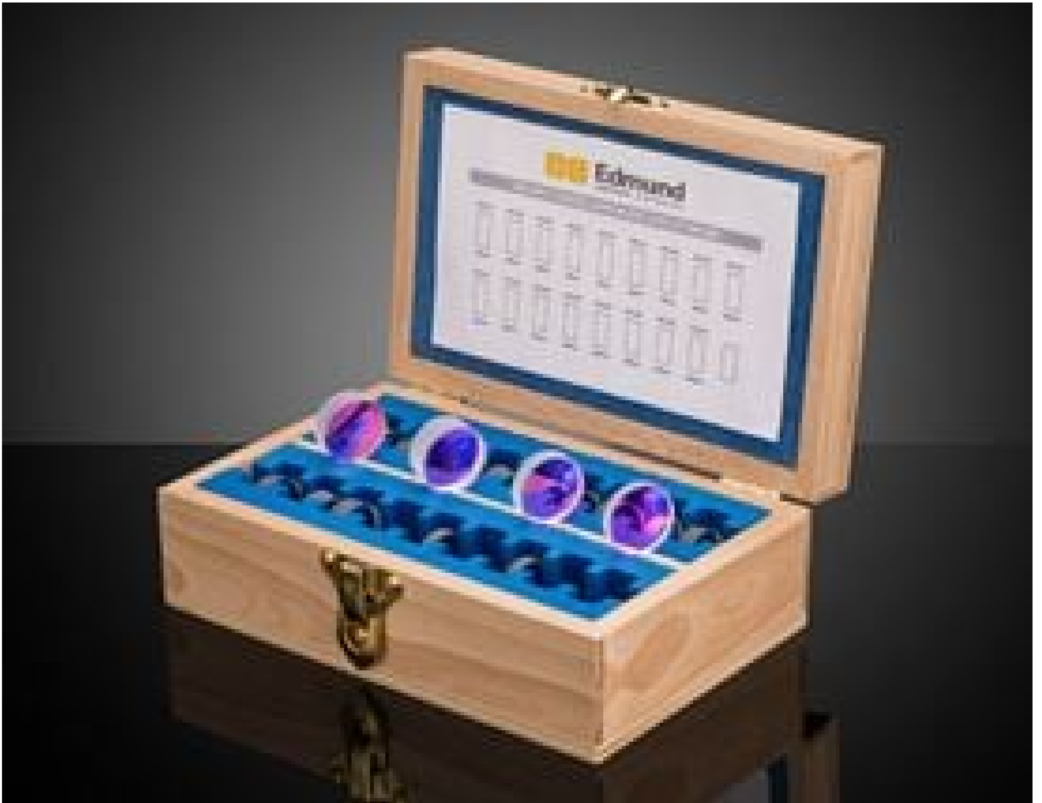
Achromatic Lens Kit