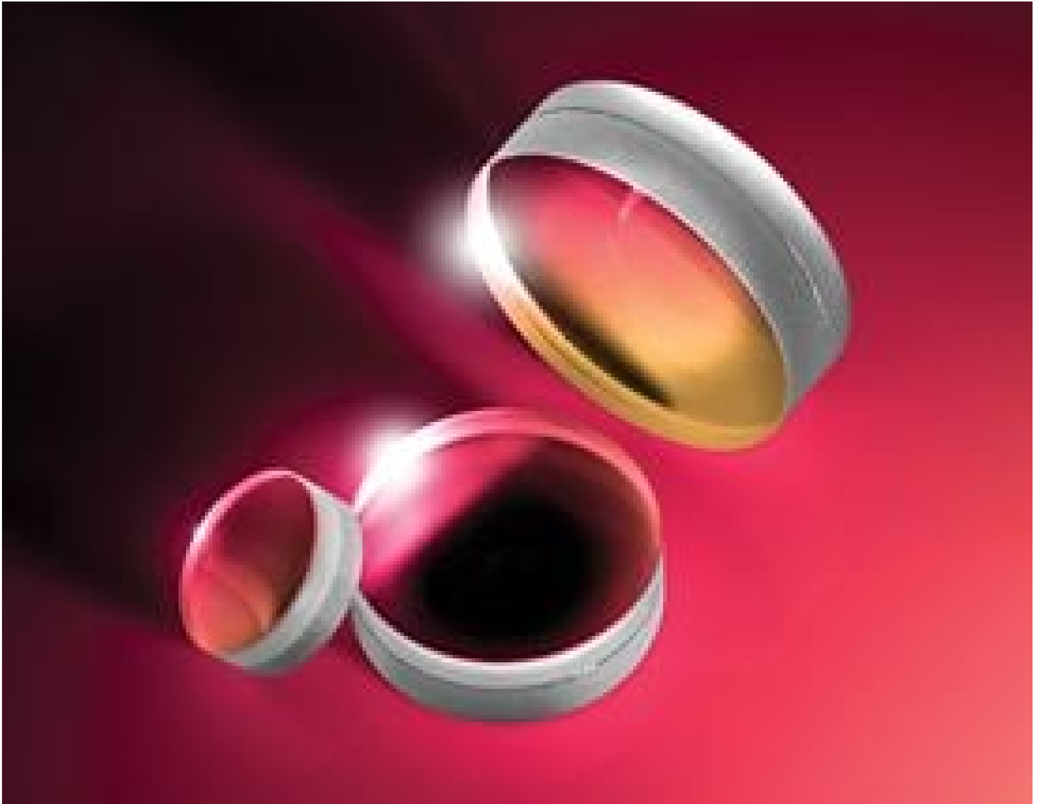
YAG-BBAR Coated Achromatic Lenses