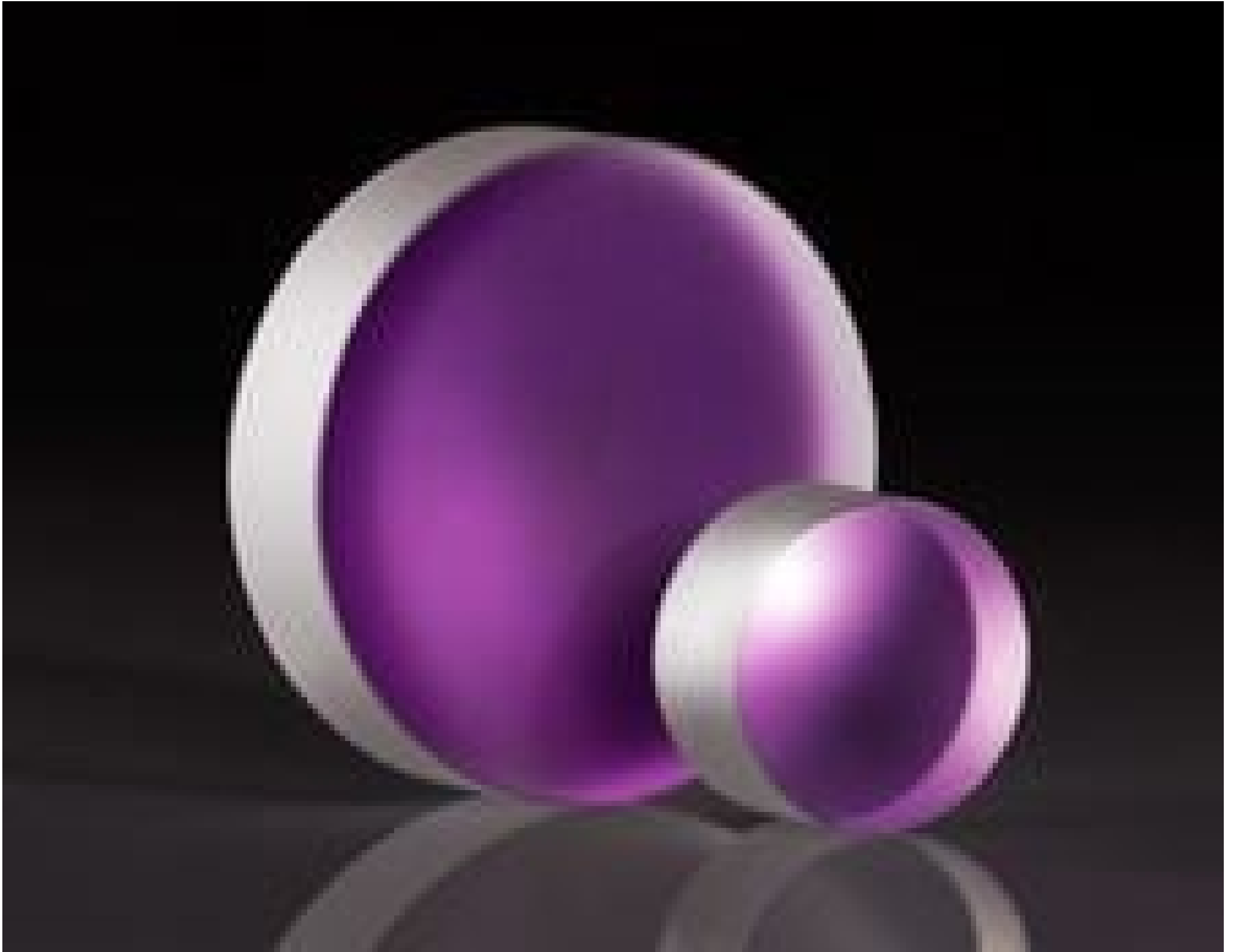
TECHSPEC® Fiber Laser Mirrors