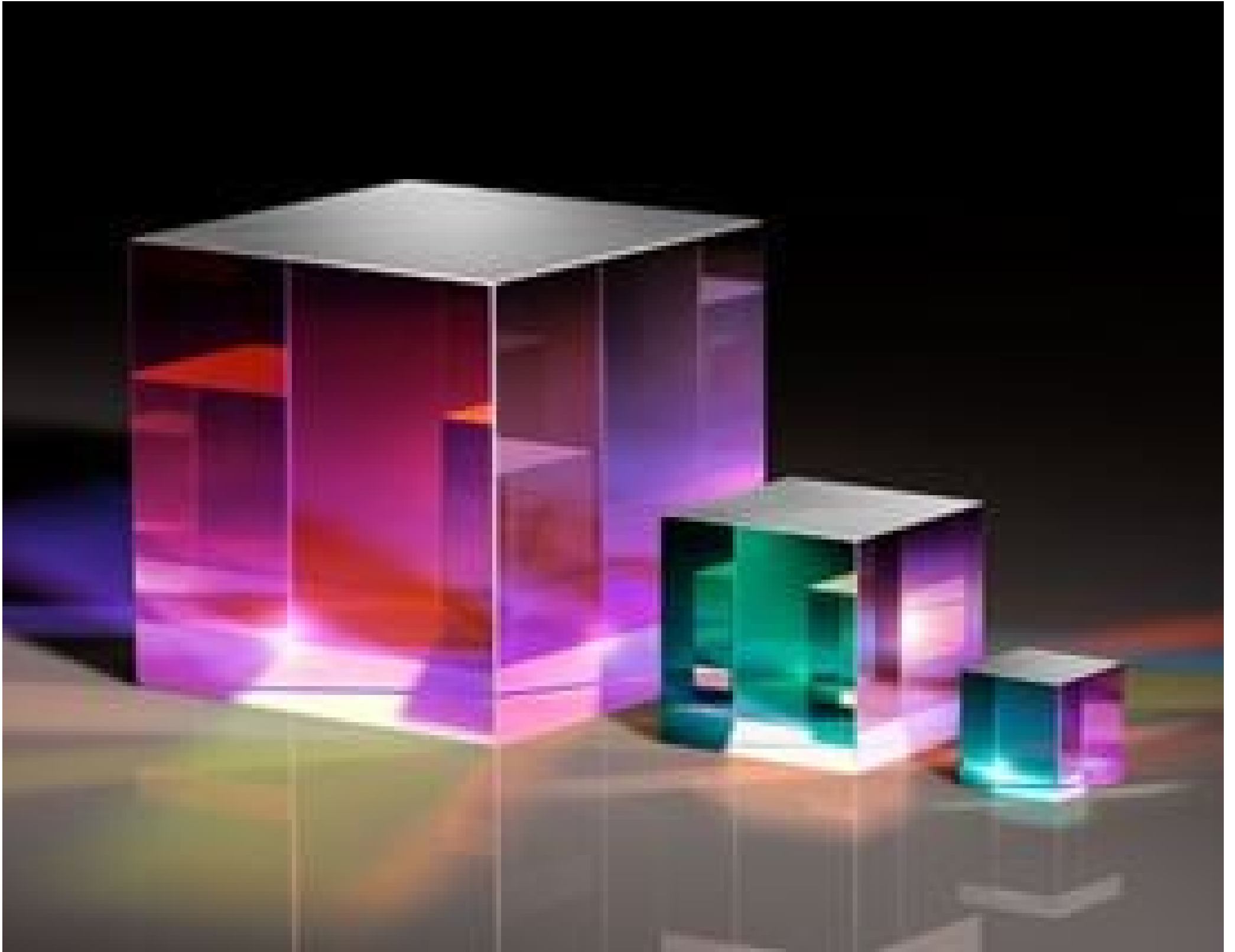
TECHSPEC Laser Line Polarizing Cube Beamsplitters