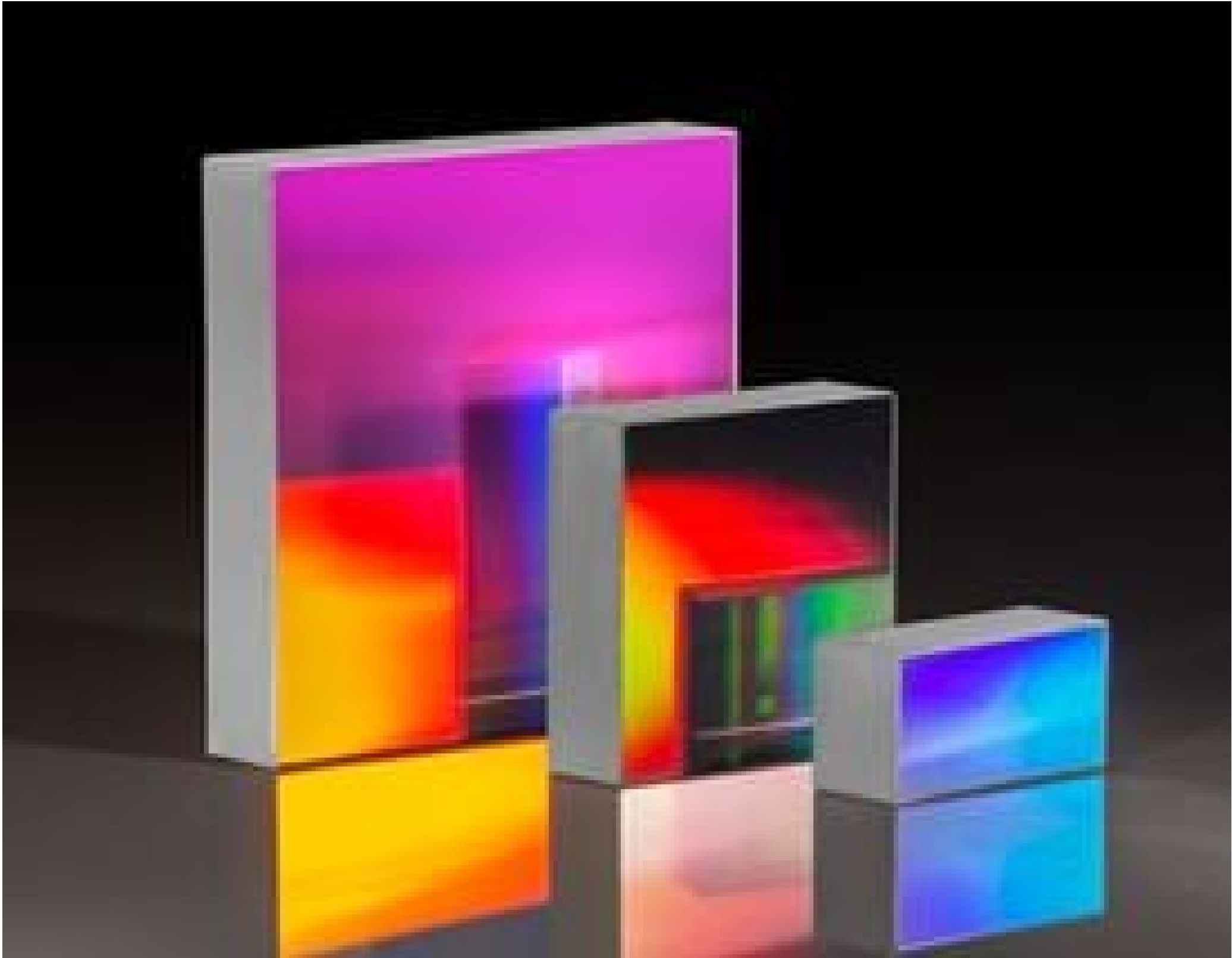
Reflective Ruled Diffraction Gratings