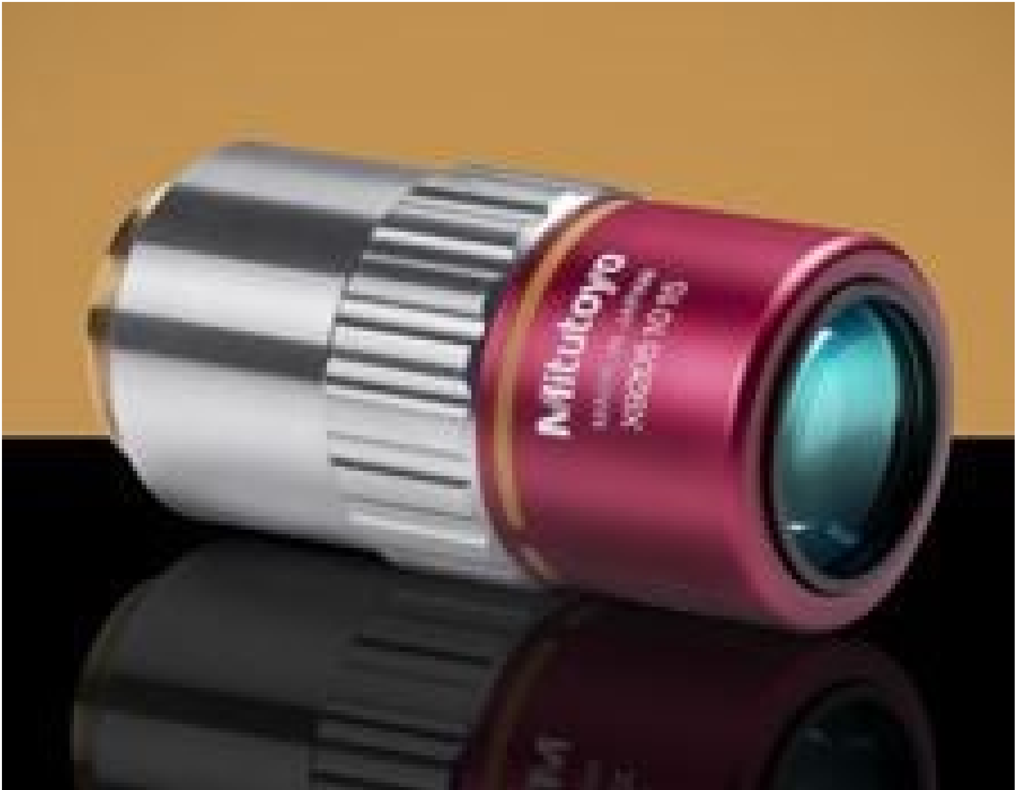
10X Mitutoyo Plan Apo NIR Infinity Corrected Objective, #46-403