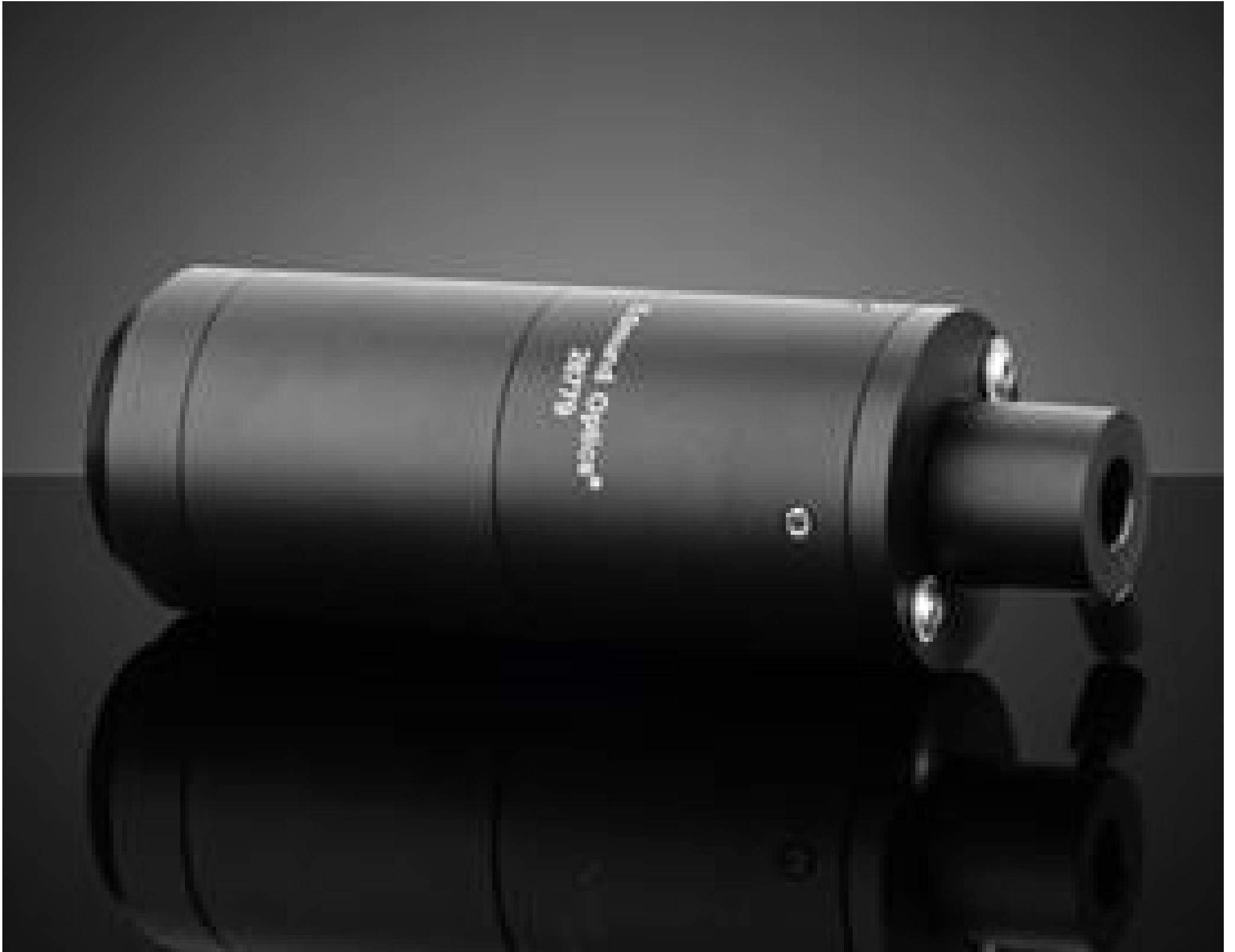
10X Focusing Lens