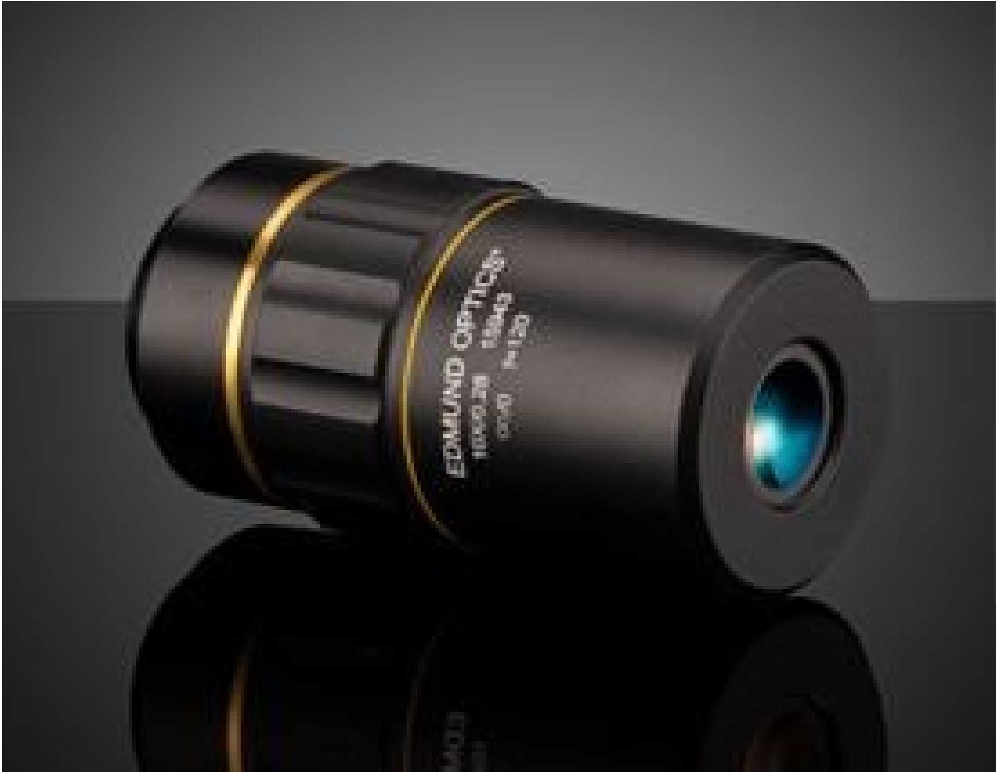
#15-943: 10X 120i Infinity Corrected Objective