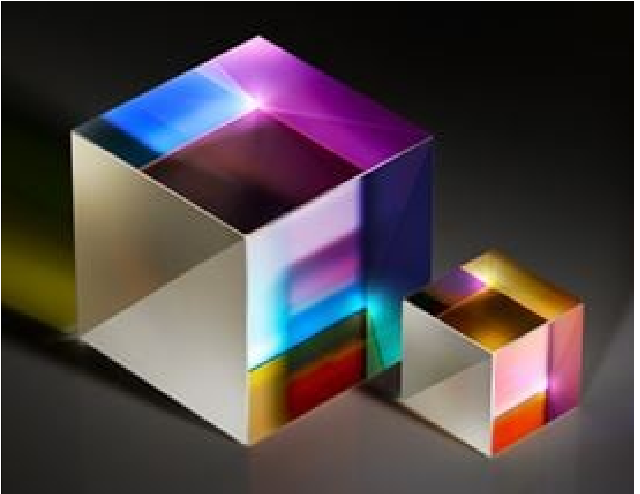
TECHSPEC® Broadband Polarizing Cube Beamsplitters