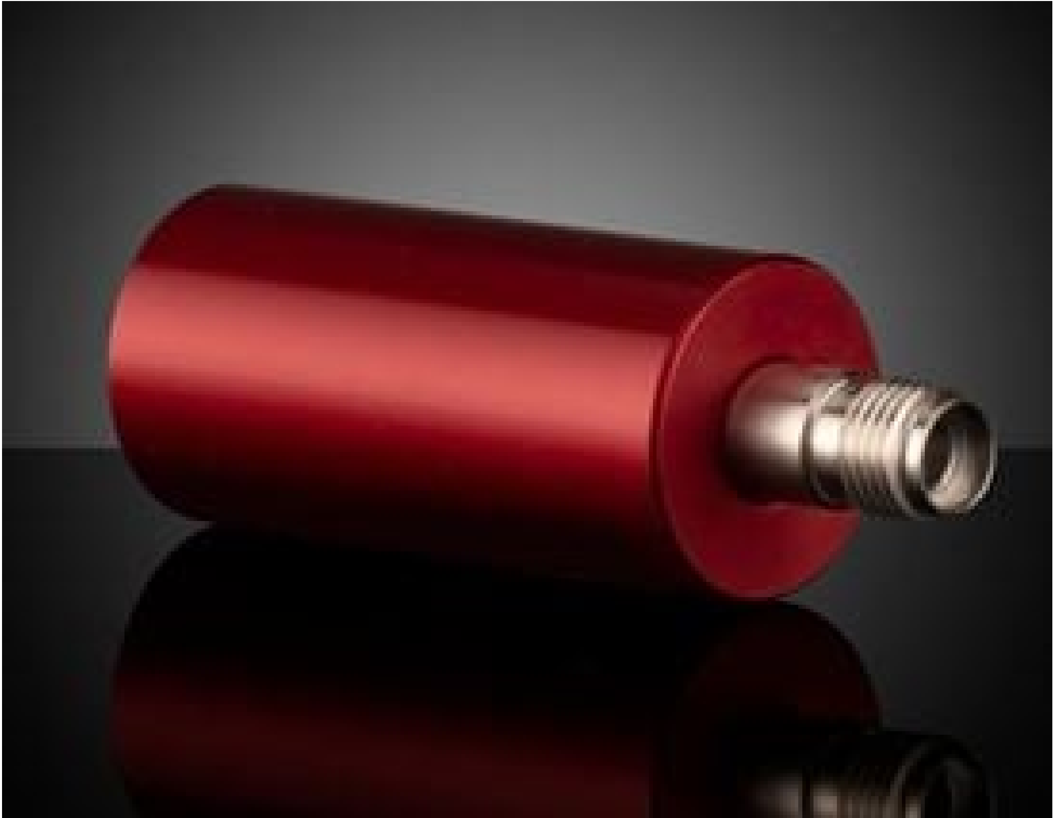
Fiber Optic Collimator, SMA (SMA adapter inserted)