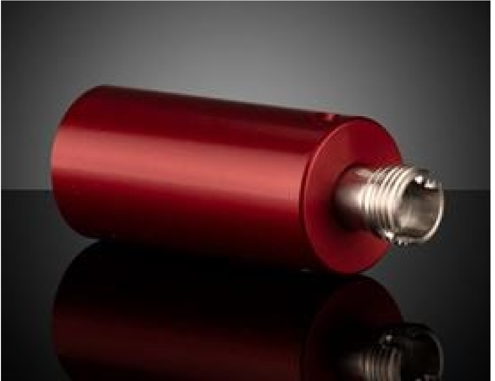
Fiber Optic Collimator, FC (FC adapter inserted)