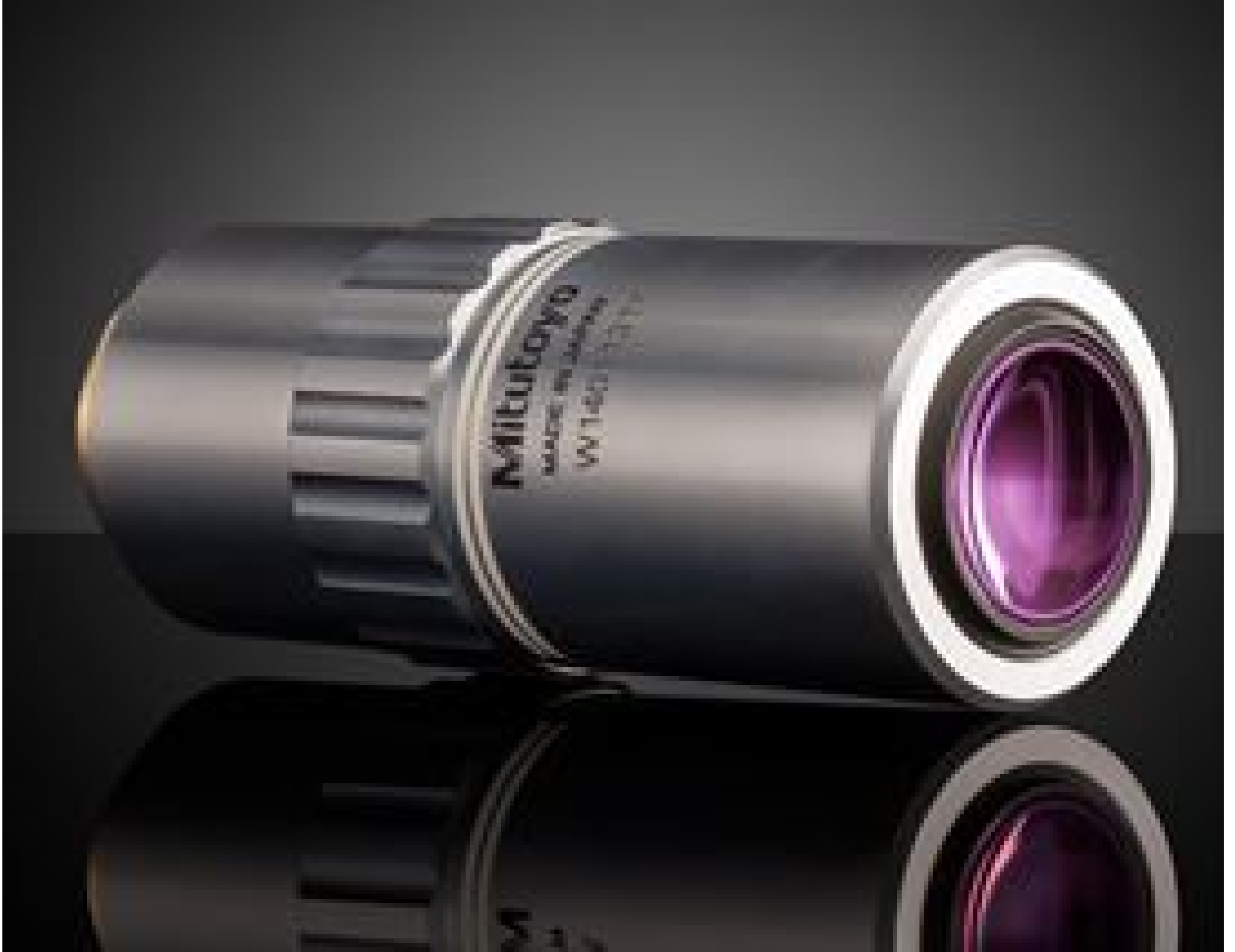
100X Mitutoyo Plan Apo SL Infinity Corrected Objective, #46-401