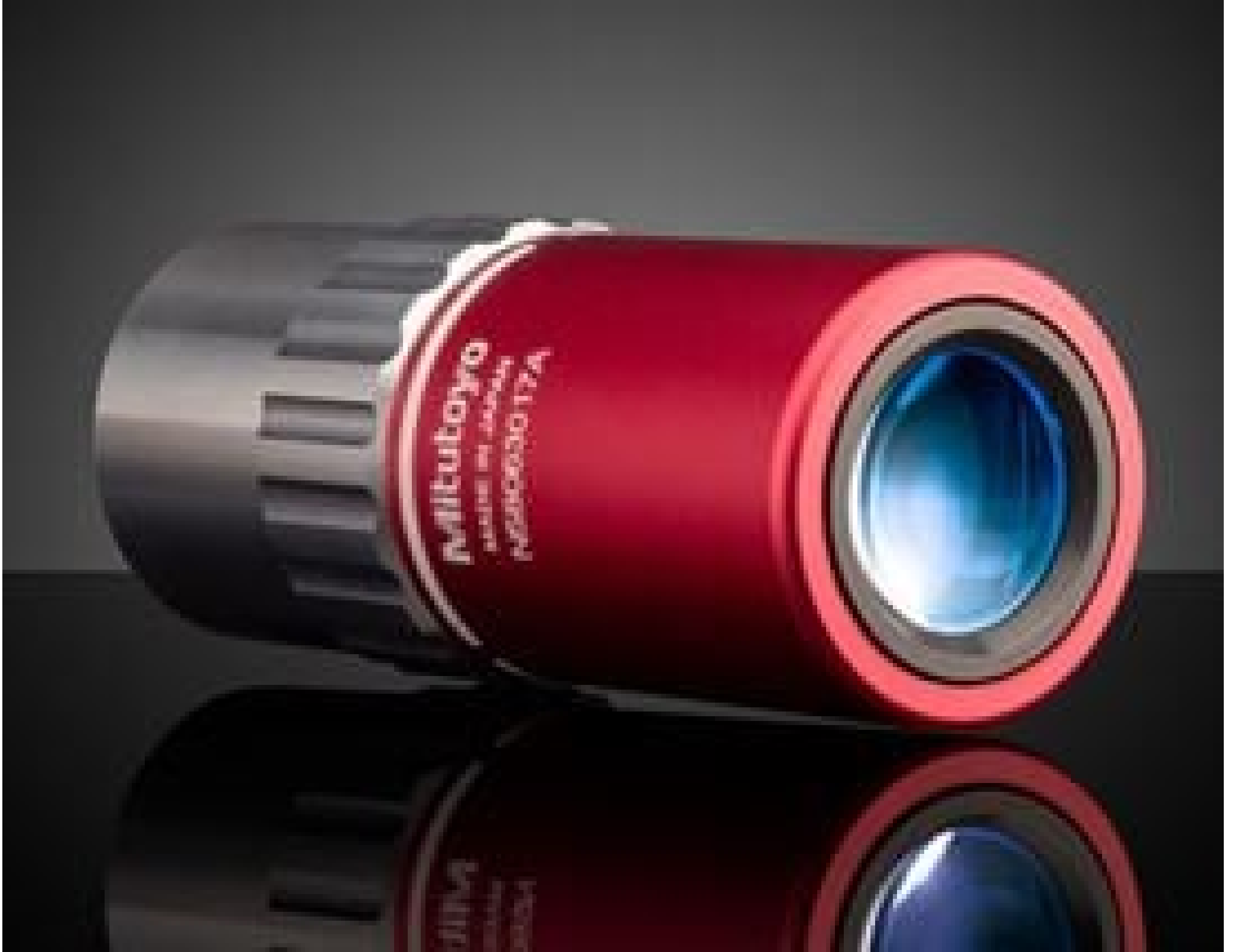
100X Mitutoyo Plan Apo NIR Infinity Corrected Objective, #46-406